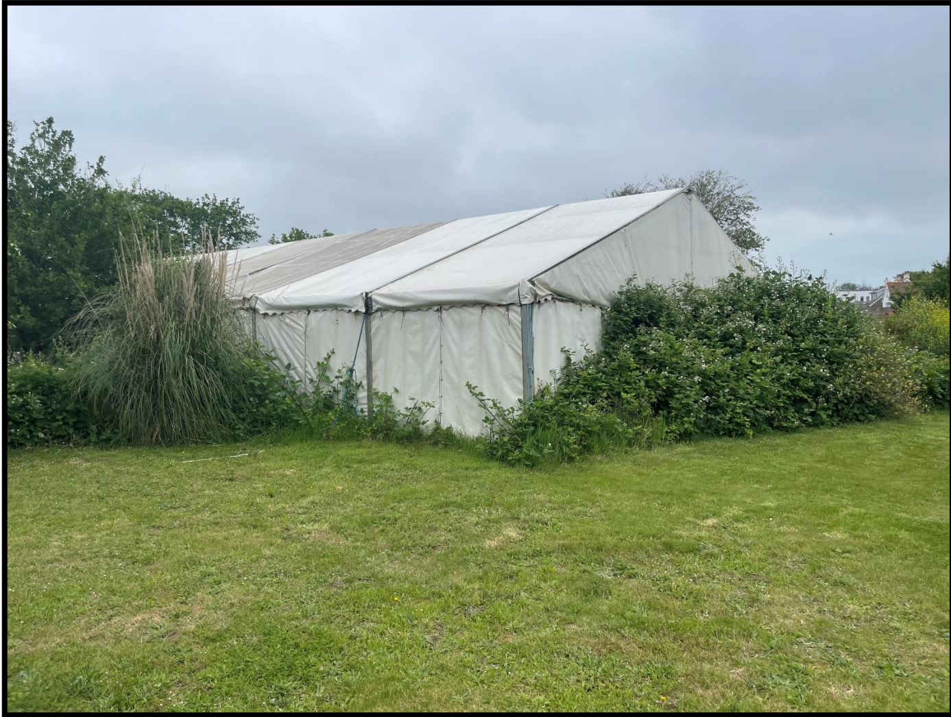
Marquee located upon the land to the East of Eastern Joinery Works, (UPRN 69142999) Cleveland, La Rue de Samares, St. Clement, JE2 6LZ