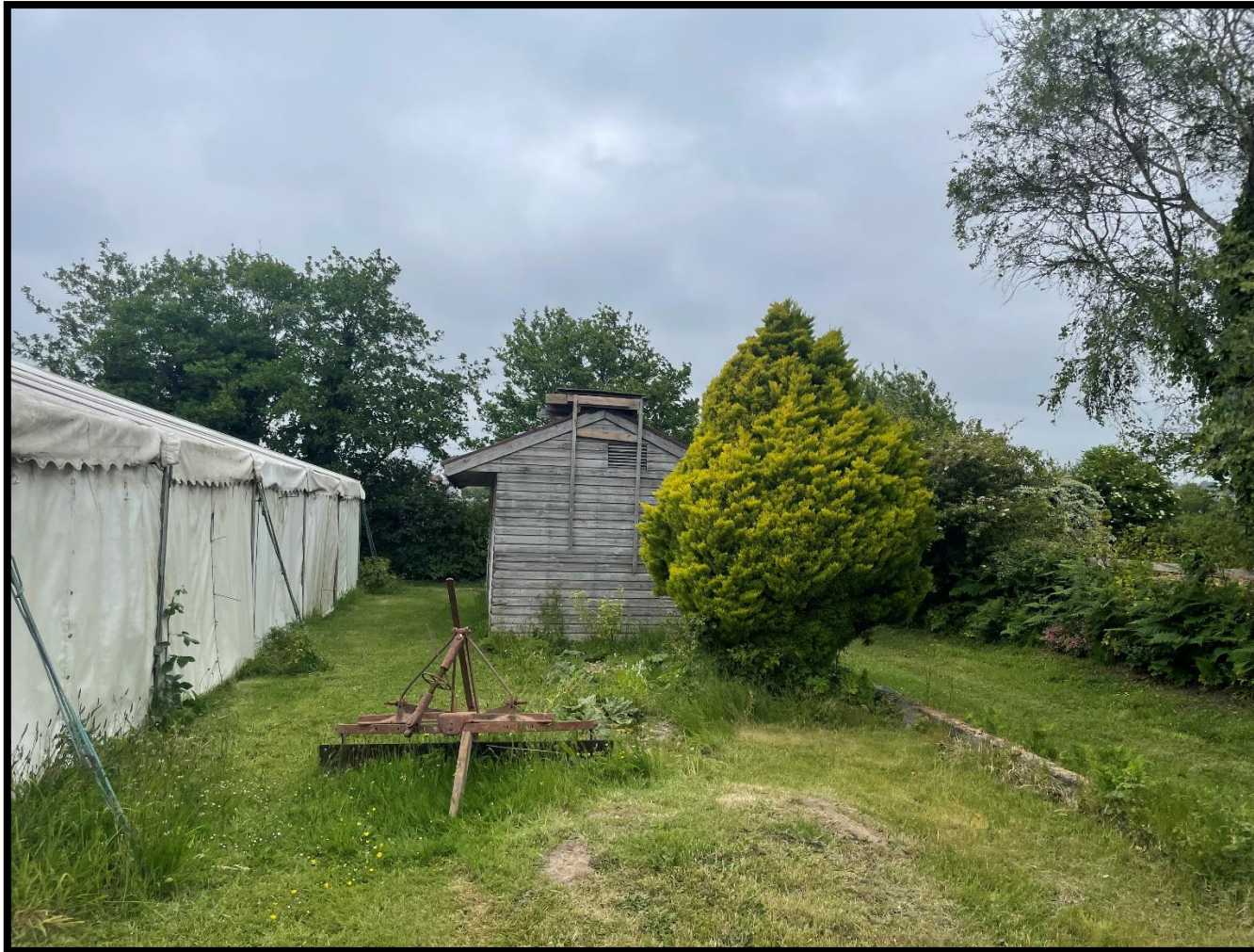
Wooden Store located upon the land to the East of Eastern Joinery Works, (UPRN 69142999) Cleveland, La Rue de Samares, St. Clement, JE2 6LZ