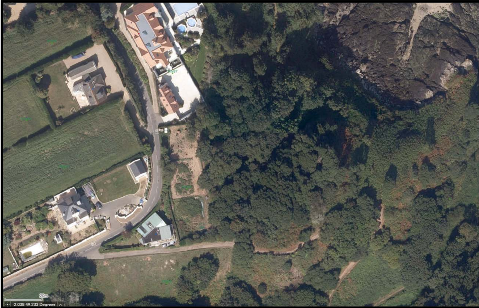
JERSEY MAPPING – AERIAL IMAGE 2014