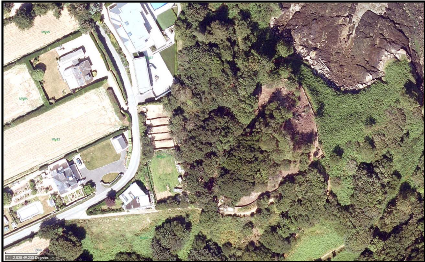
JERSEY MAPPING – AERIAL IMAGE 2020