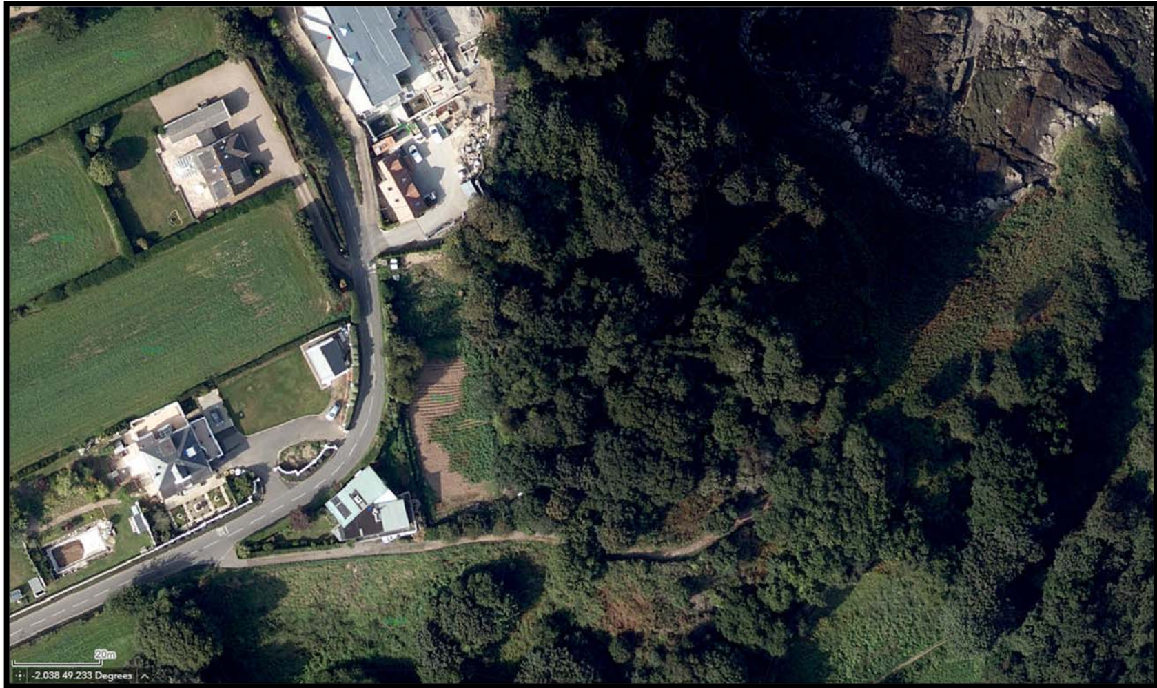
JERSEY MAPPING – AERIAL IMAGE 2017