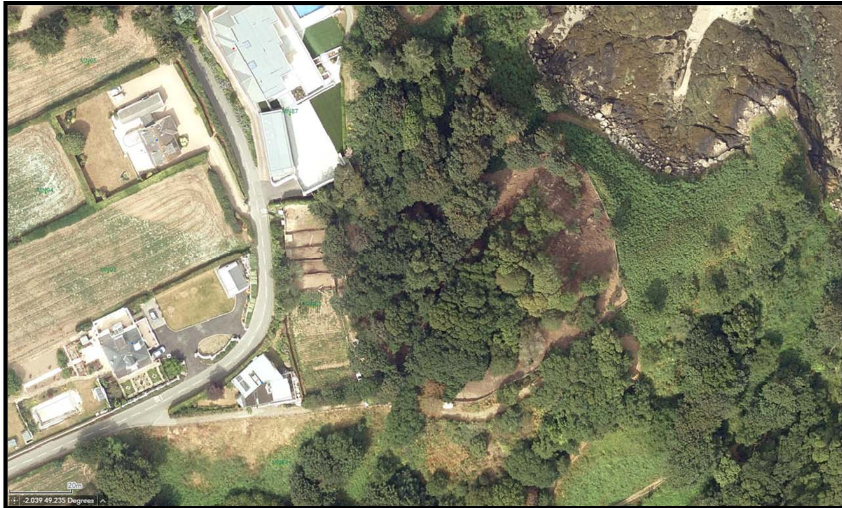
JERSEY MAPPING – AERIAL IMAGE 2019