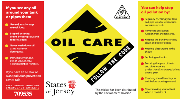
Oil tank sticker

All oil tanks must display an Oil Care sticker, so that the owner is aware of the pollution hotline number (stickers can be obtained from the Planning and Environment Department, tel: 441600).