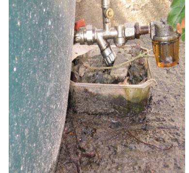
Leaking oil filter

In cases where it is considered that the oil tank or pipework is unsafe and the owner is not adhering to the advice given, please contact Environmental Protection, who can issue a site improvement notice, under The Water Pollution (Jersey) Law, 2000.