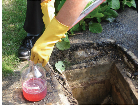
Oil contamination of a borehole

Ensure that oil tanks and pipework are fitted according to the requirements of the Building Bye-laws (Jersey) 2007*.