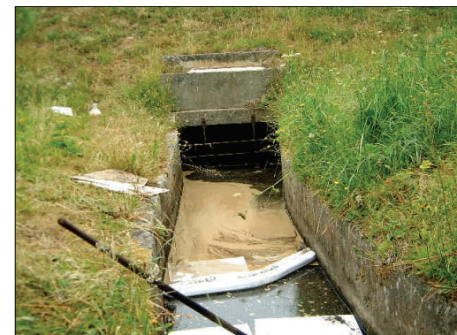
Oil in a stream

A guidance leaflet produced by the Oil Care Group