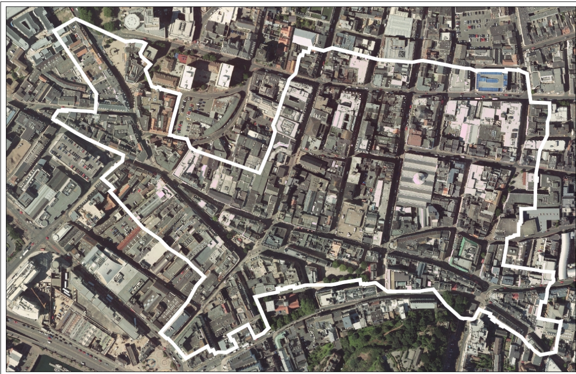
Map 5.2 Core Retail Area