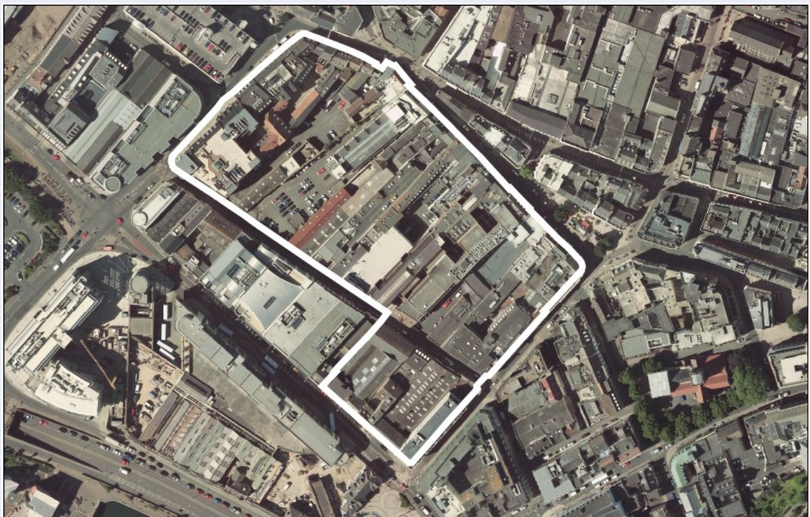
Map 5.1 Retail Expansion Area

5.58 New sites for retail development within and on the edge of the primary retail area are limited. Although there are areas potentially available at Hue Street and Dumaresq Street, and at Bath Street, they do not represent logical extensions of the shopping centre as they extend the retail floorspace into peripheral areas away from the primary shopping frontages. There are also conservation concerns and a desire to see a return of the lost historic grain in these areas. The preferred area for retail expansion in the comparison goods sector is to the south of Broad Street where there is a large block of potentially developable land between Broad Street, Commercial Street and the Esplanade. The expansion of the primary retail area into this area, with a focus on increased comparison goods retailing, provides the opportunity to better link King Street to Liberty Wharf and the Waterfront by the creation of new pedestrian retail streets.