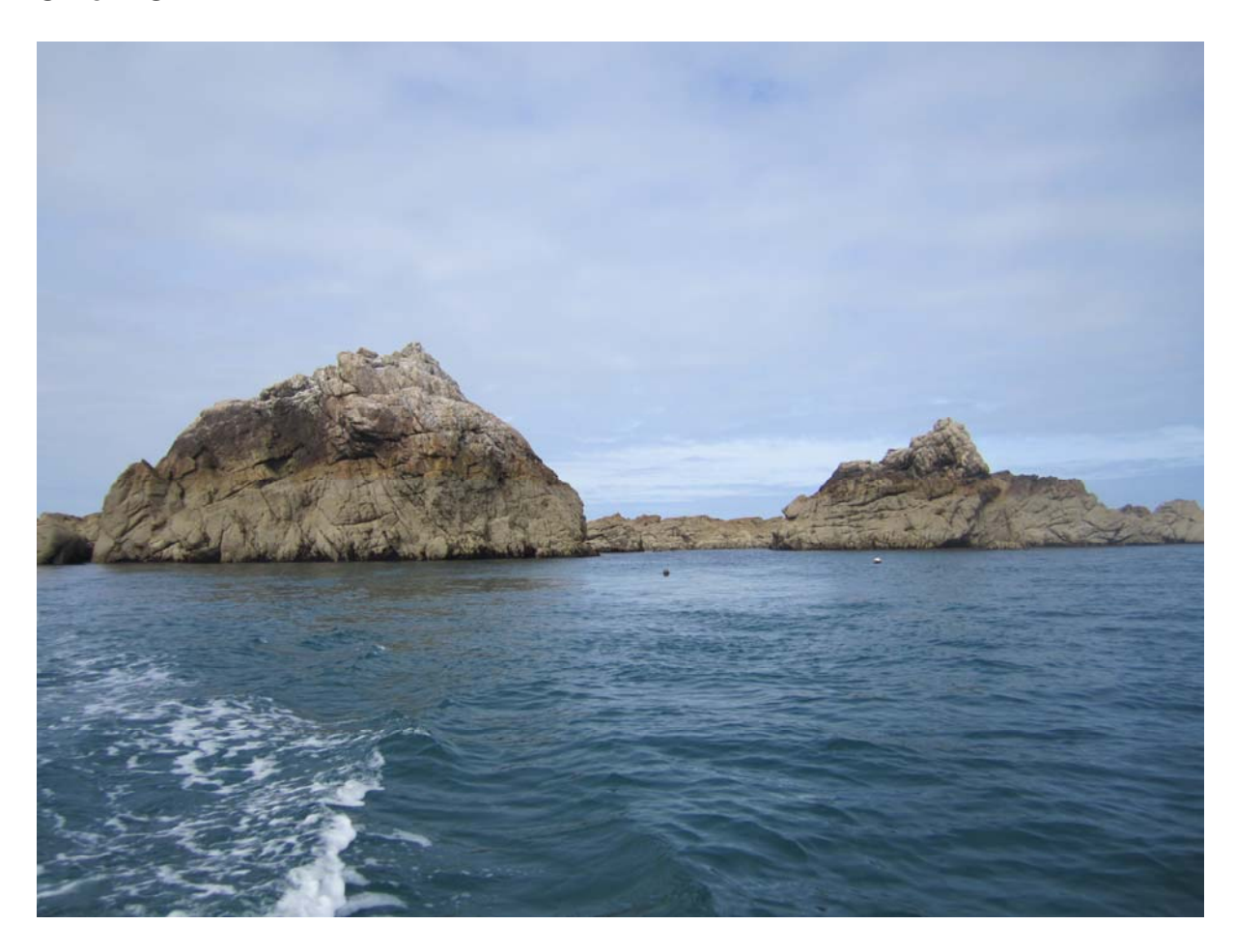
Great Rock and Sharp Rock, Paternosters

Limited jurisdiction remains an issue as many environmental impacts that affect or have the potential to effect arise from outside of the site and outside Jersey's territorial waters. An example of this would be some aspect of fisheries management, particularly management of pelagic fish stocks, where ultimate authority rests with the UK or EU.