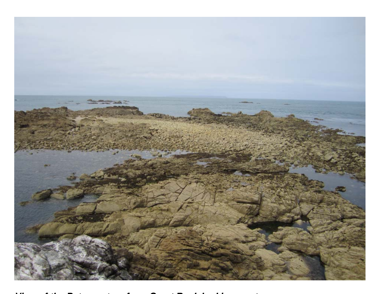
View of the Paternosters from Great Rock looking west