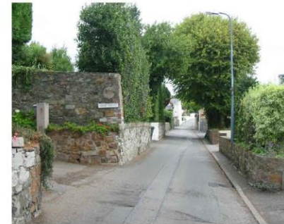
Typical Existing Street View - Looking East

client States of Jersey Transport & Technical Services