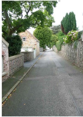
Typical Existing Street View - Looking West

New traffic calming bollards to be spaced at 20000mm intervals. Bollards to define edge of footway and carriageway