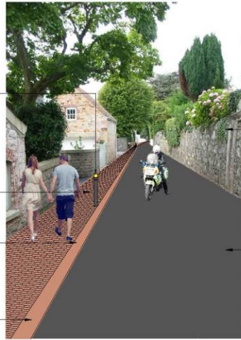
Typical Proposed Street View - Looking West

Dished drainage channel edgings to finish flush with macadam carriageway