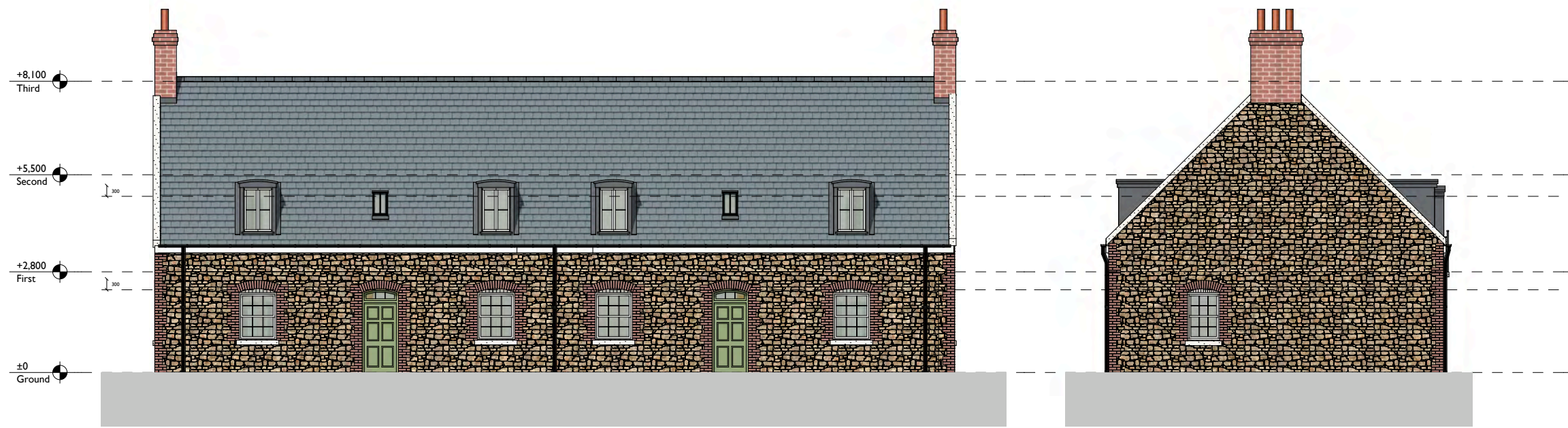
SOUTH (FRONT) ELEVATION 1:50