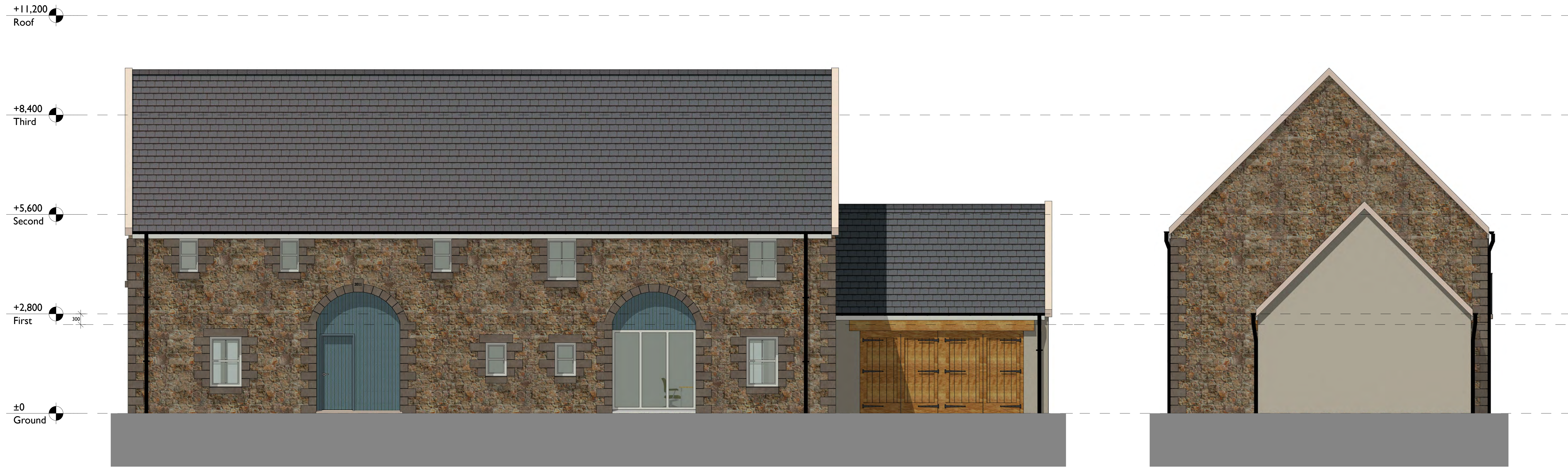
SOUTH EAST (FRONT) ELEVATION 1:50