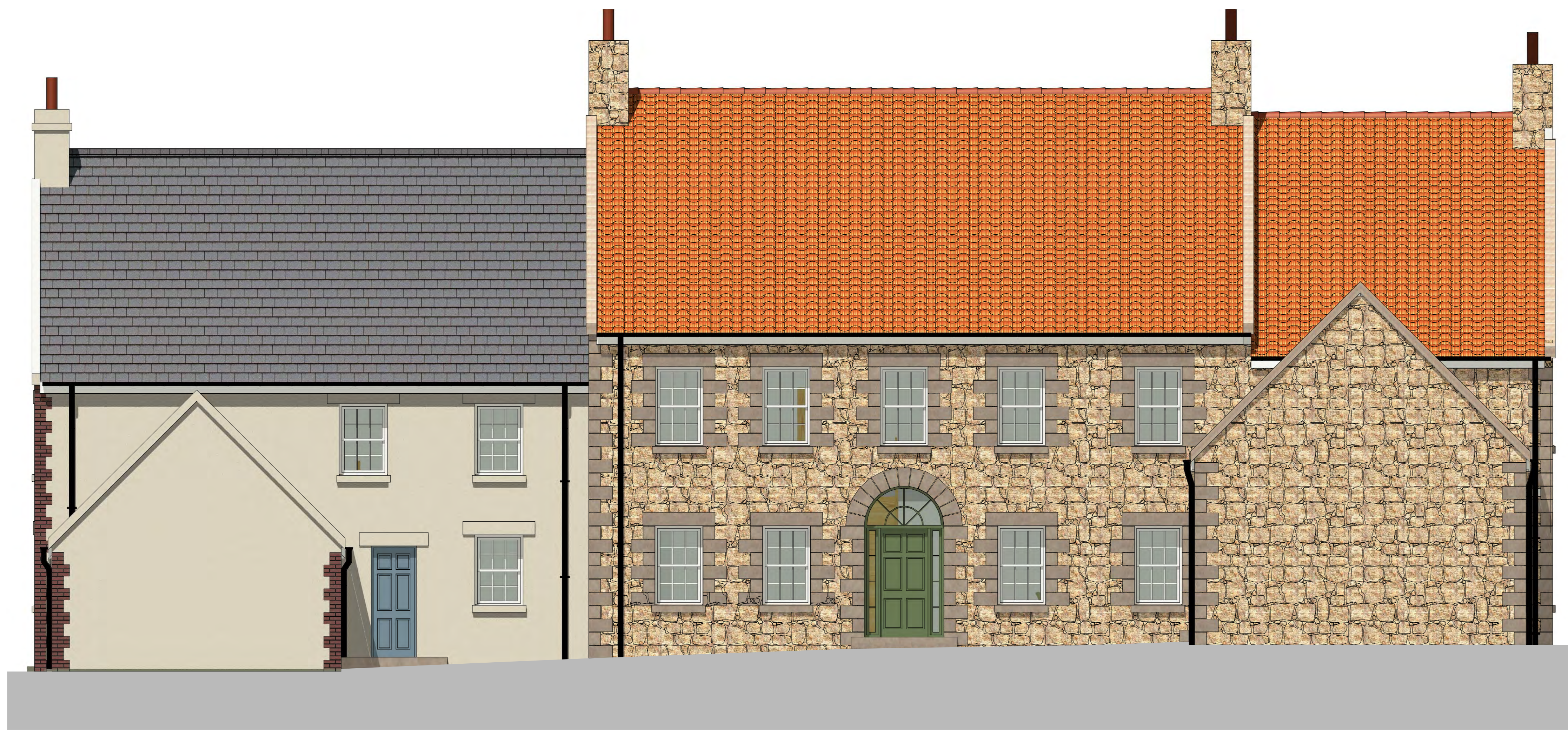
EAST (FRONT) ELEVATION