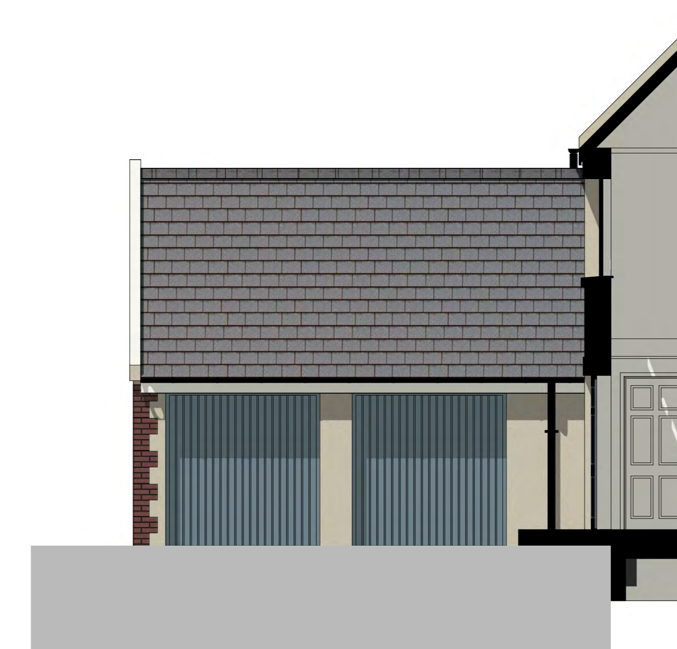
PART ELEVATION B