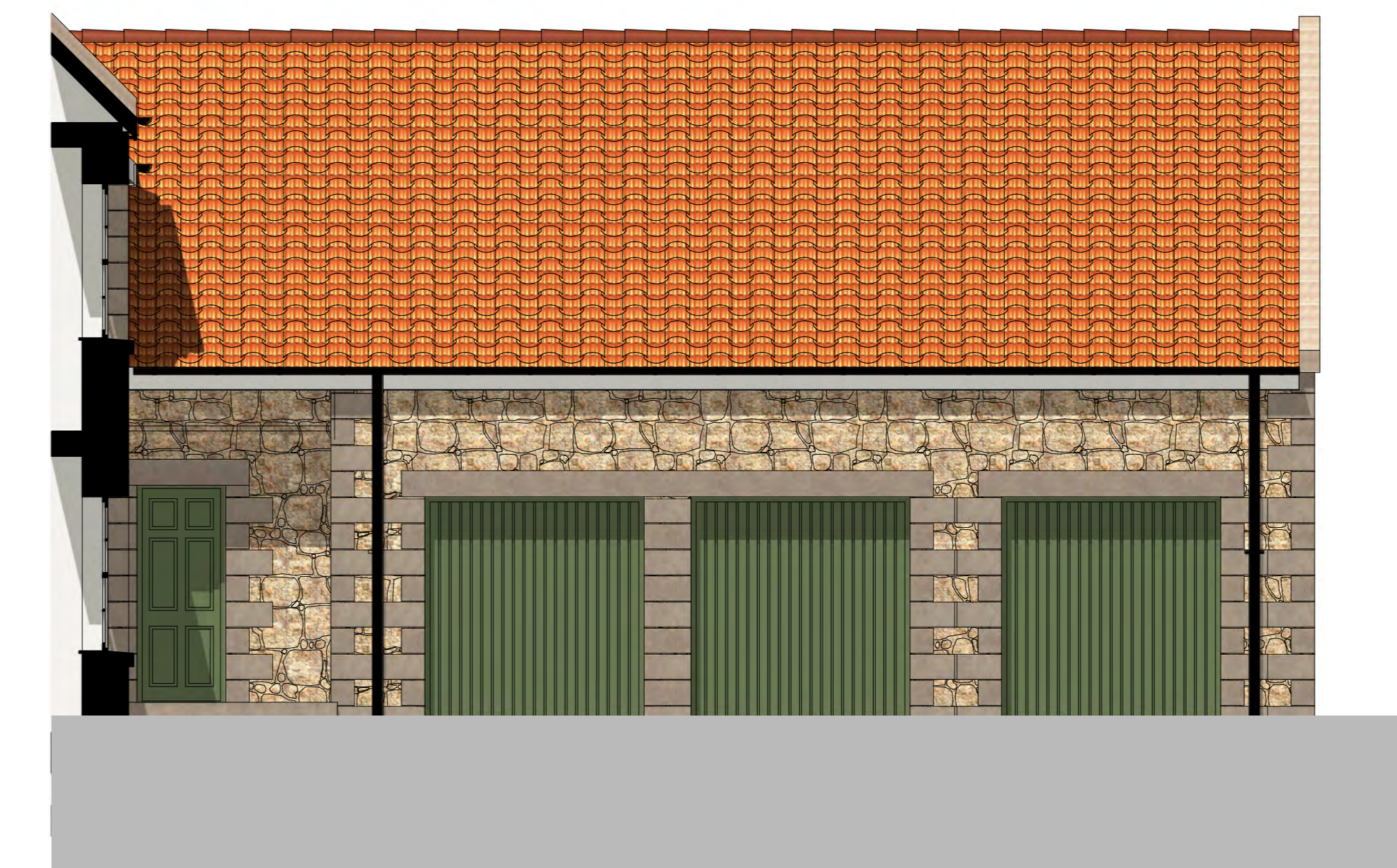
PART ELEVATION A