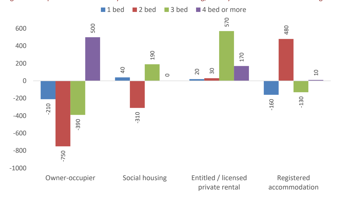
Figure 3 – Surpluses and shortfalls by tenure and size of dwelling; three-year totals under +325 net migration

Under a +500 person per annum net migration scenario: