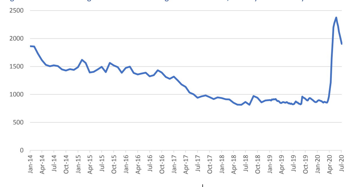
Figure 1 – Number of registered ASW excluding CRESS claimants, January 2014 – 5 July 2020

Figure 1 shows a historical series of the number of people registered as ASW (excluding CRESS claimants) from January 2014 to date.