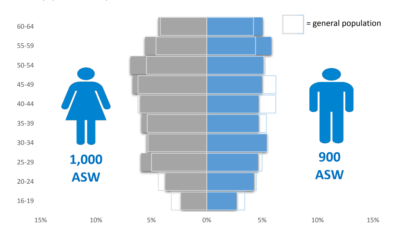
Figure 2 – Age and sex distribution of individuals registered as ASW compared with proportions in the general population<sup>4</sup>, 5 July 2020

On 5 July 2020, 13% of people registered as ASW were under 25 years of age (250 individuals); 5% of the total were teenagers, aged 16-19 years (100 individuals).