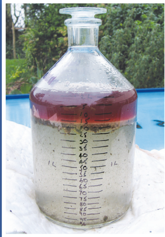
Above: Sample taken from a borehole contaminated with oil.

The Island's water resource supports a large diversity of wildlife and is essential for the provision of safe and clean drinking water.