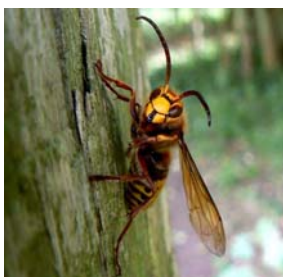
A male hornet showing typically long antennae