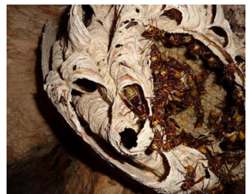
A hornets' nest. The beige coloration and blistery bulges are diagnostic

Hymettus Ltd is the premier source of advice on the conservation of bees, wasps and ants within Great Britain and Ireland.