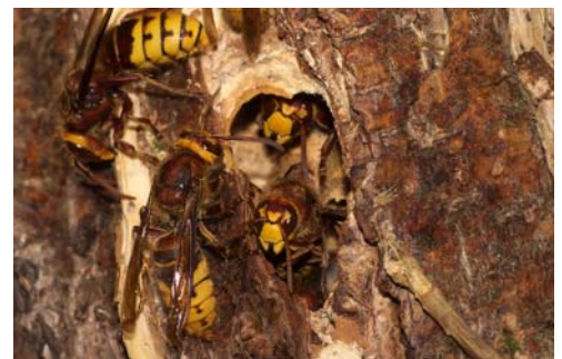
Worker hornets emerging from a nest in a hollow tree