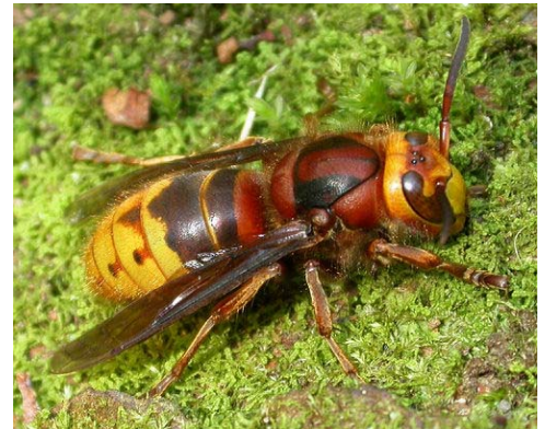
A queen hornet after emerging from hibernation

They help maintain balance in nature by preying upon (and so controlling) numbers of other invertebrate species, some of which are regarded as agricultural pests.