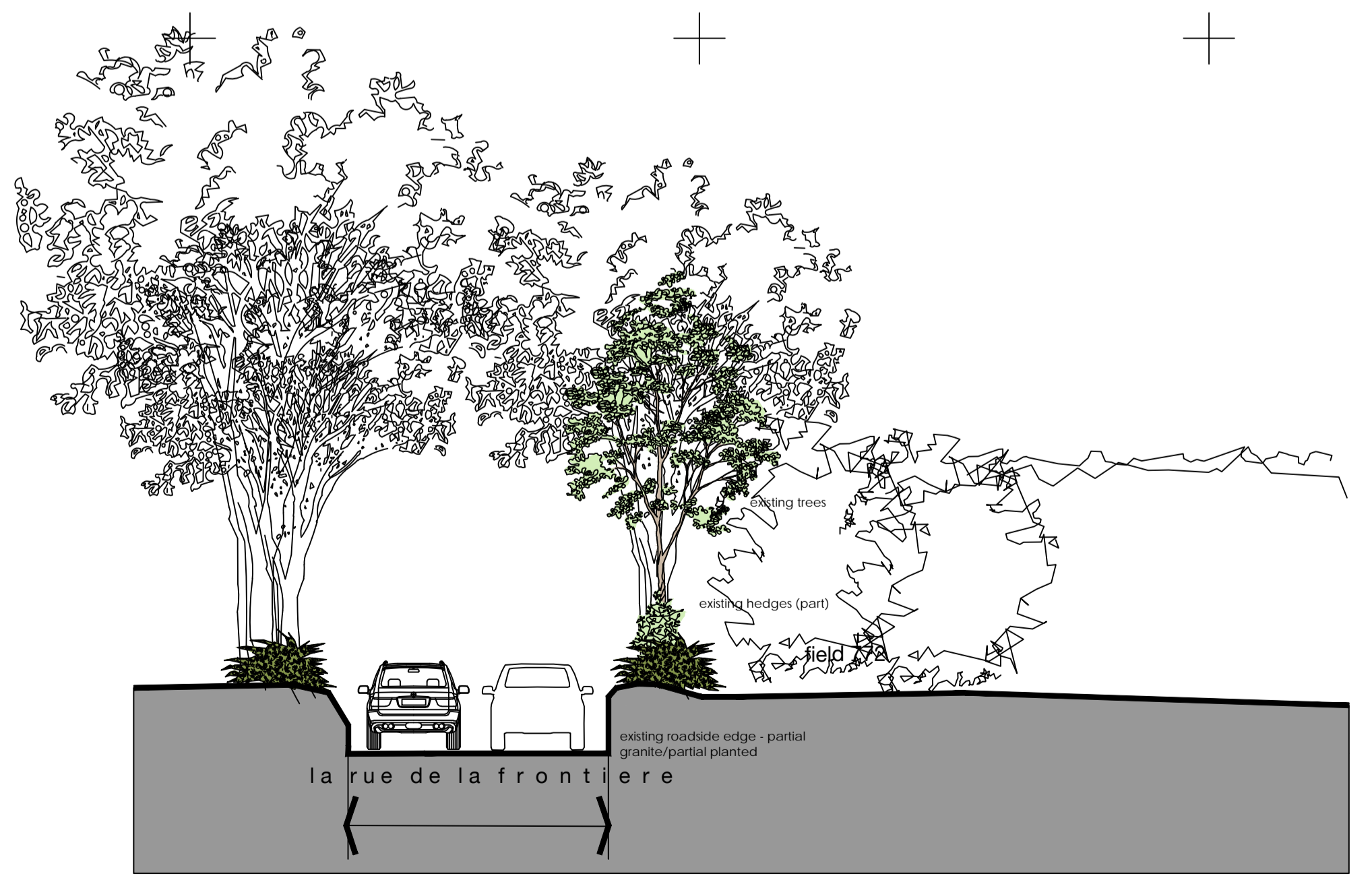
site road access as existing