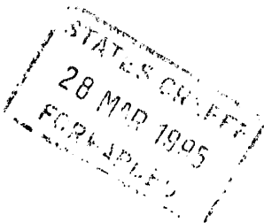
Deputy Greffier of the States