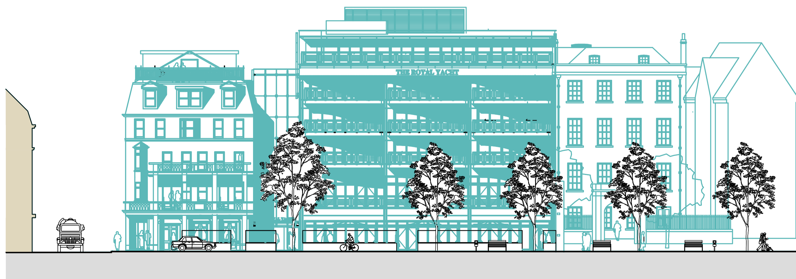
elevation A-A' - 1:200 scale