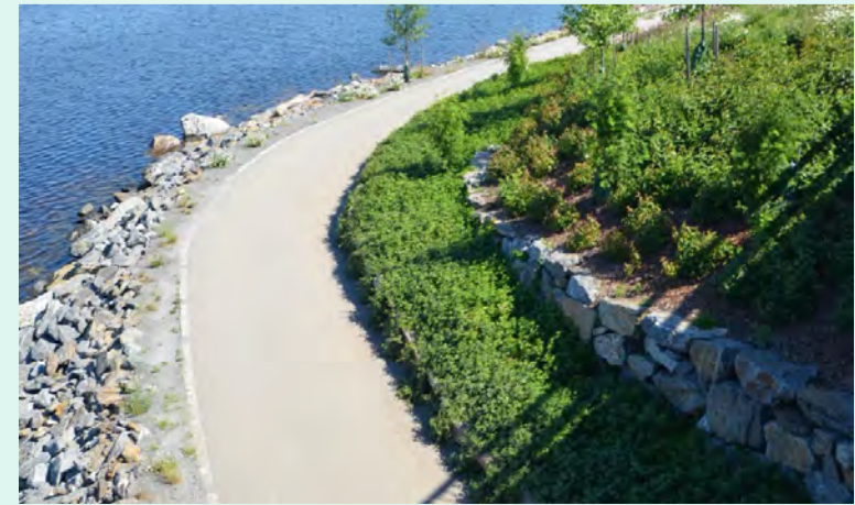
Continuous promenade wrapping around La Collette headland.