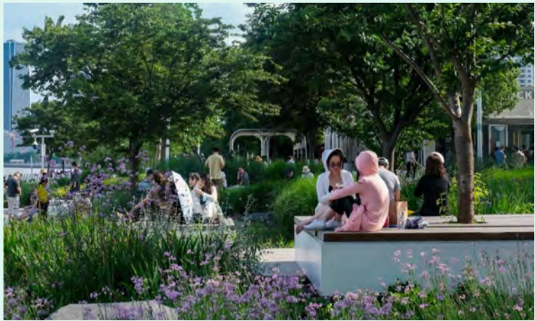
Coastal planting creates intimate social spaces.