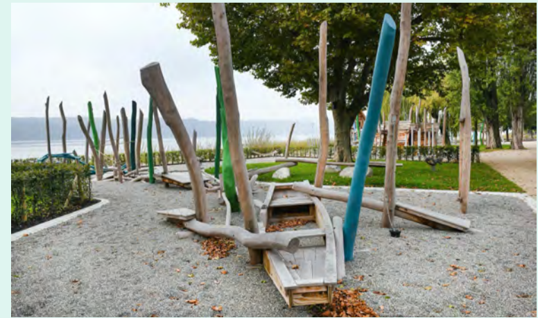
Sculptural play features.