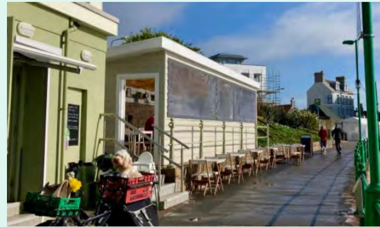
Additional spill out space to remove shared promenade space.