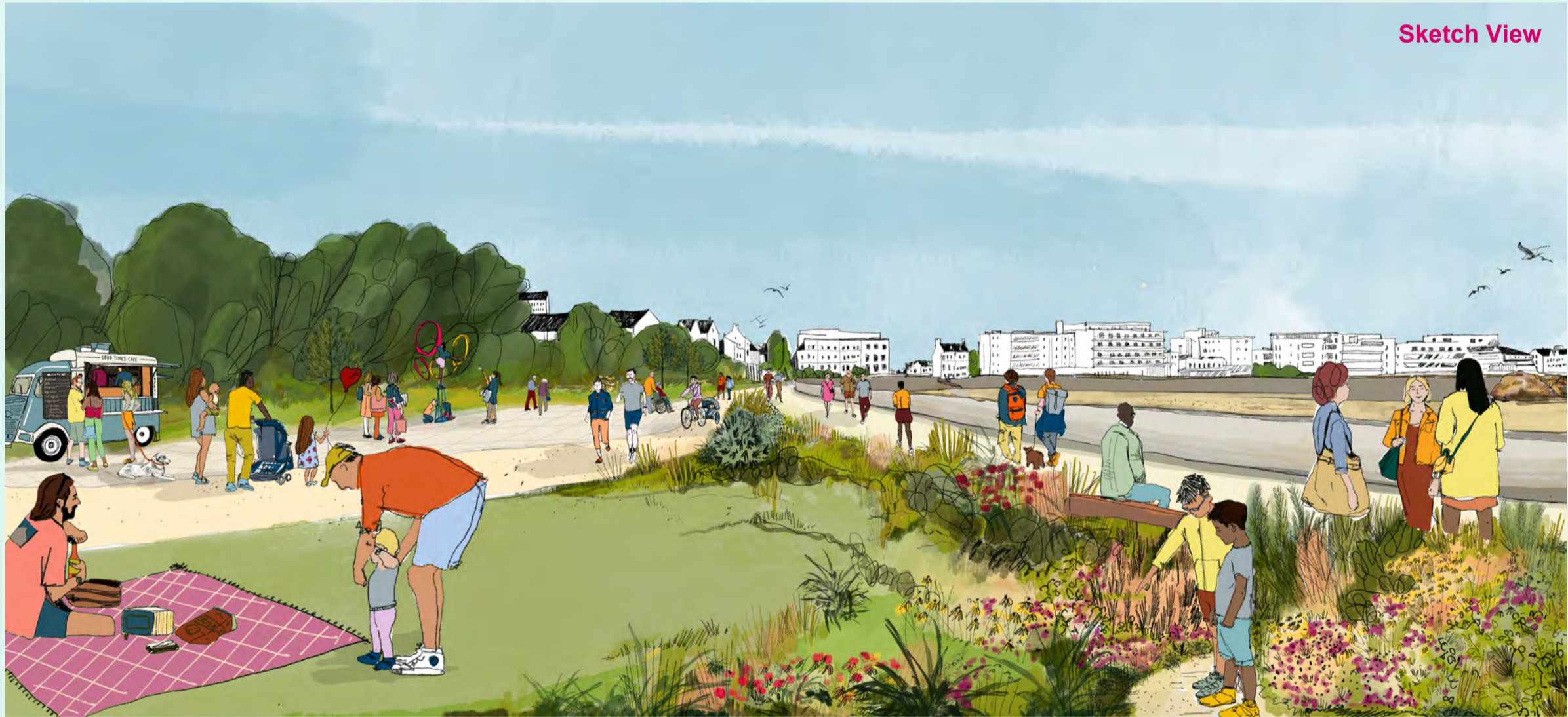
Artists impression looking northwards across the extended La Collette Gardens