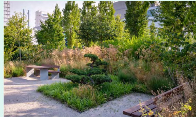
Naturalistic planting provides nooks for seating and dining.