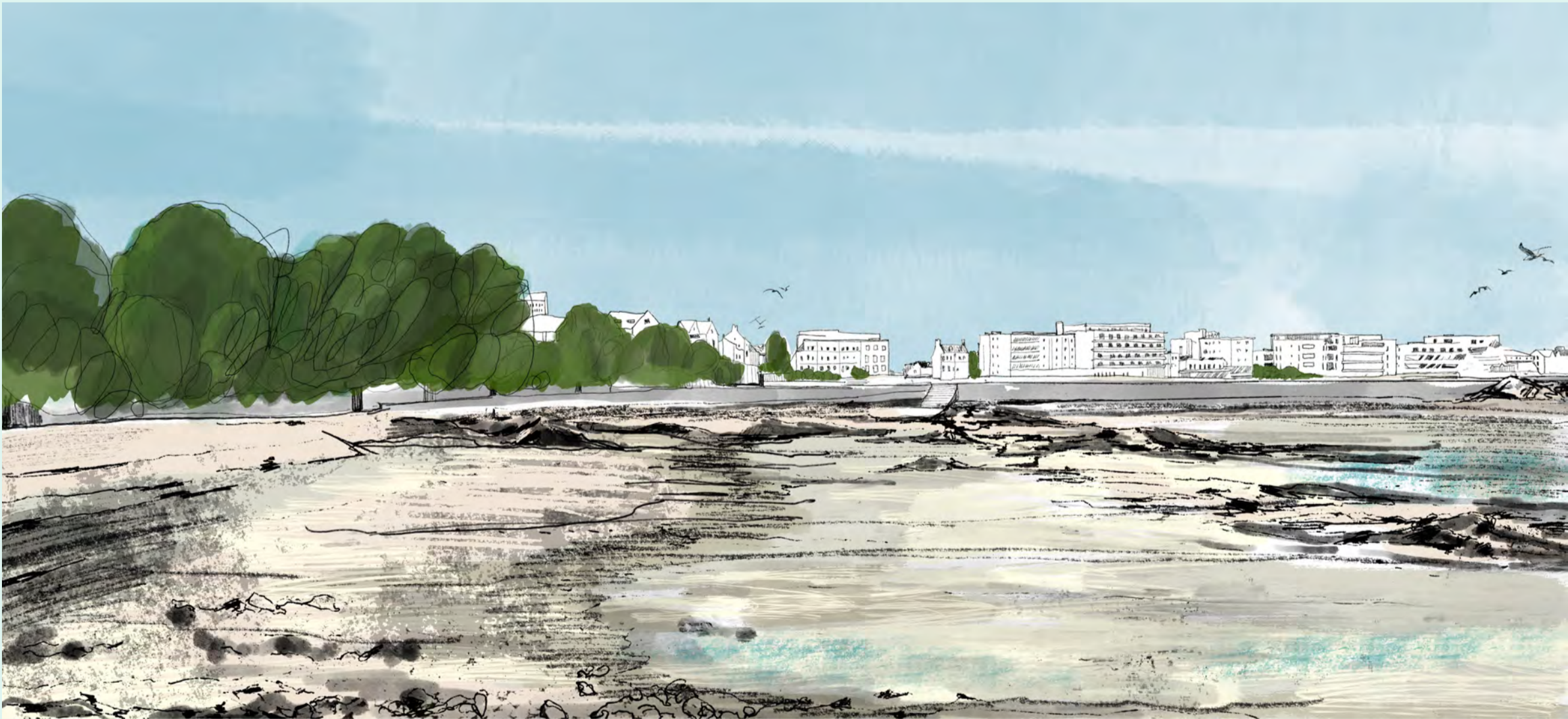
Existing view looking north across the seafront

An extended seafront that links La Collette gardens and provides new public amenity and recreation space