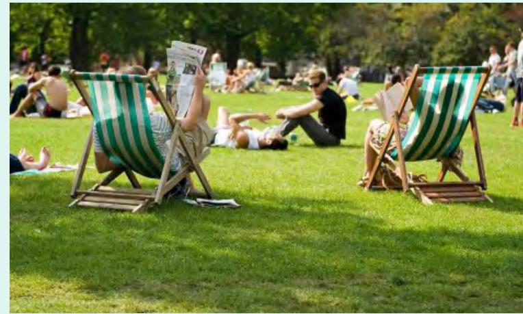
Lawn spaces for events and socialising.