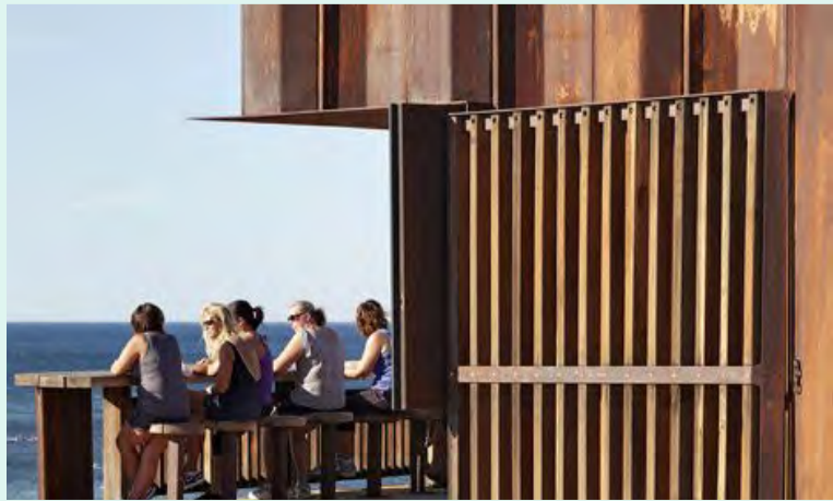
Local businesses creating vibrant destinations.