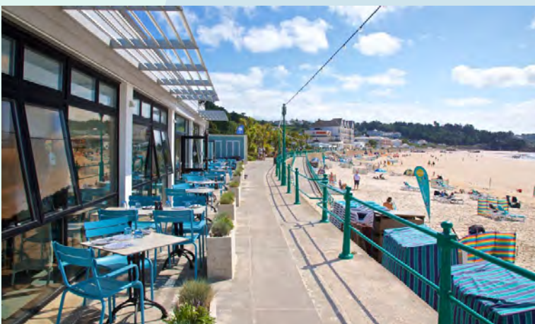
Spill-out seating activates the promenade (St Brelade's Bay, Jersey).