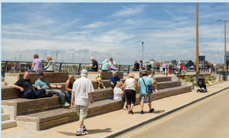
Timber terraces making the most out of the level change.