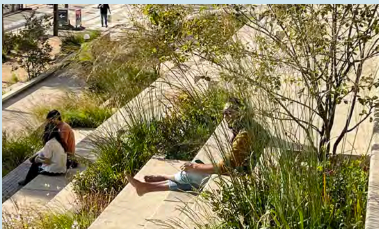
Planting set into terraces, providing biodiversity and visual interest.