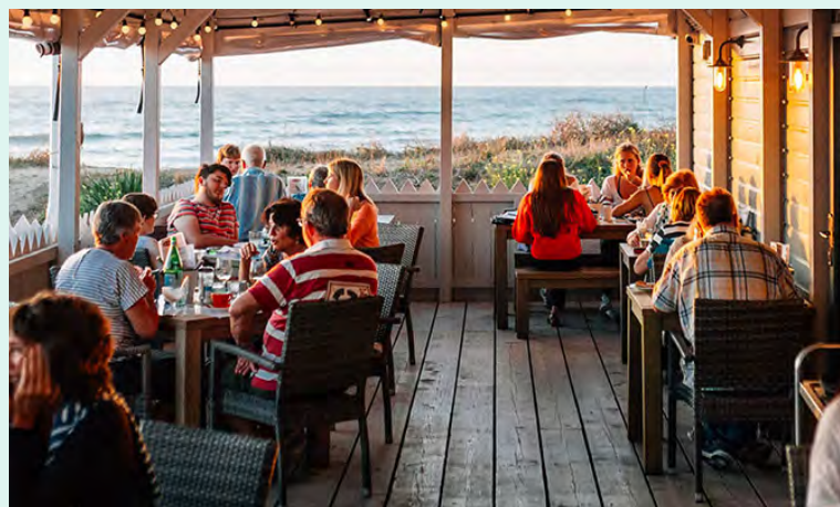
Spill out seating.