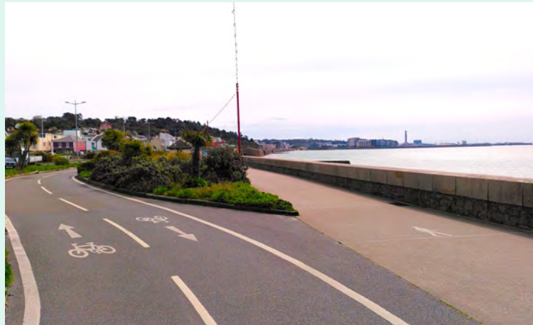
Active travel route along the promenade (St Aubin, Jersey).