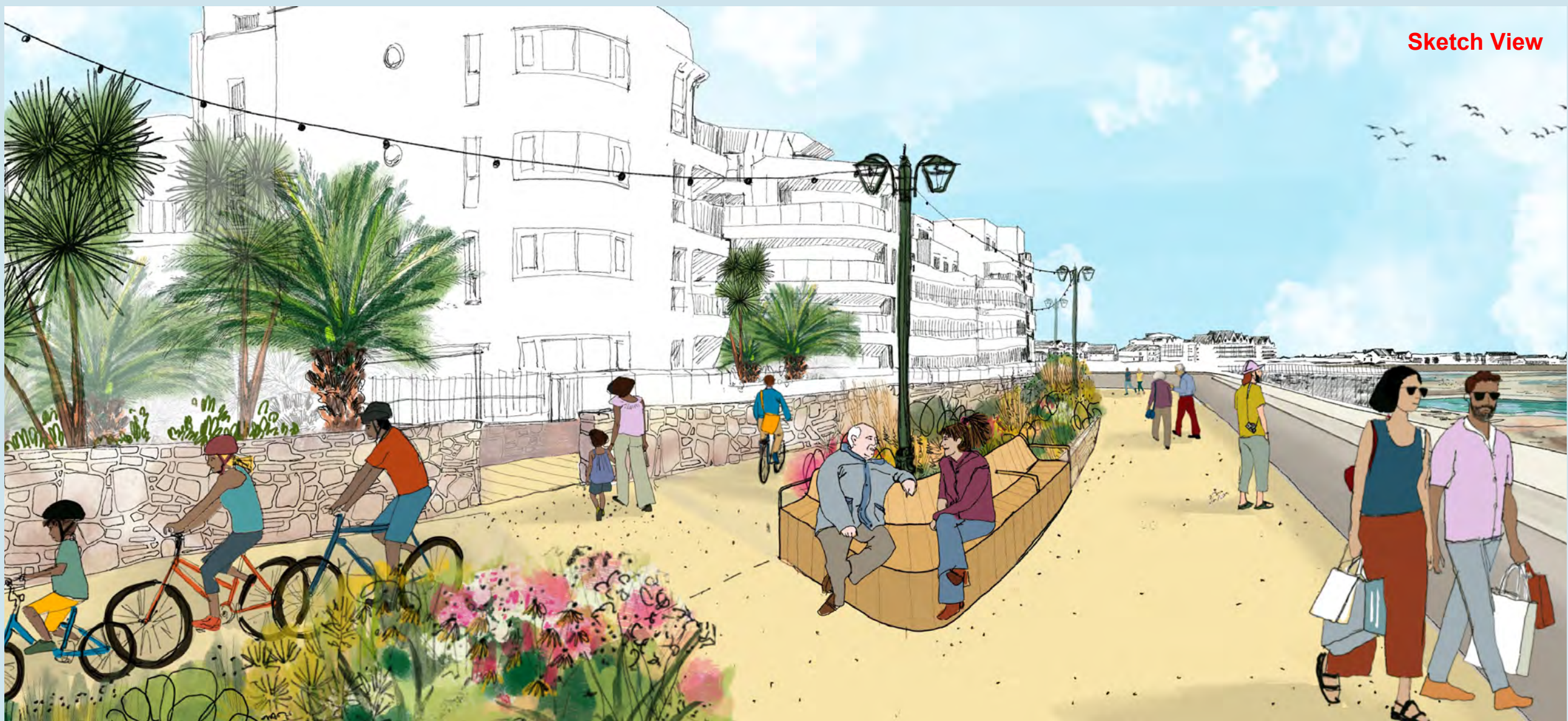
Artists impression looking east along the new promenade