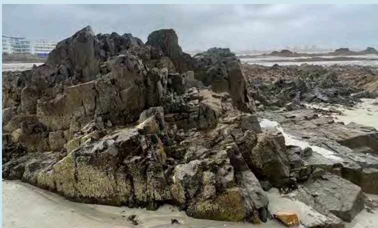
Preserving the setting of the local rock formations.