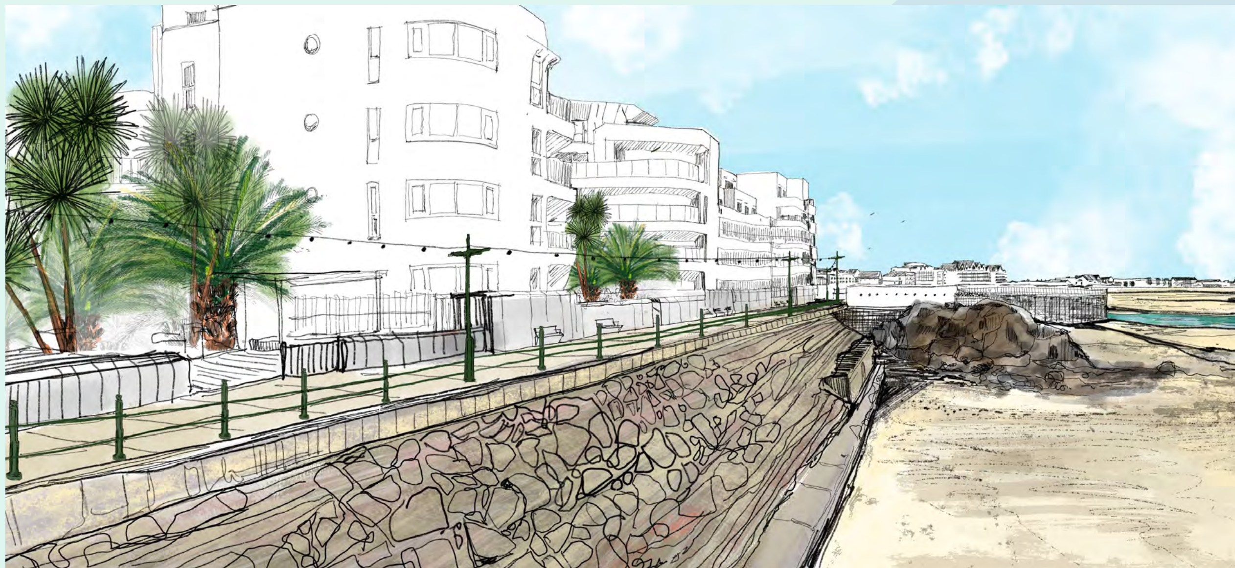
Existing view looking east along the seafront

The western end of the promenade will be transformed with new informal play, coastal planting and trees, and continuous cycling