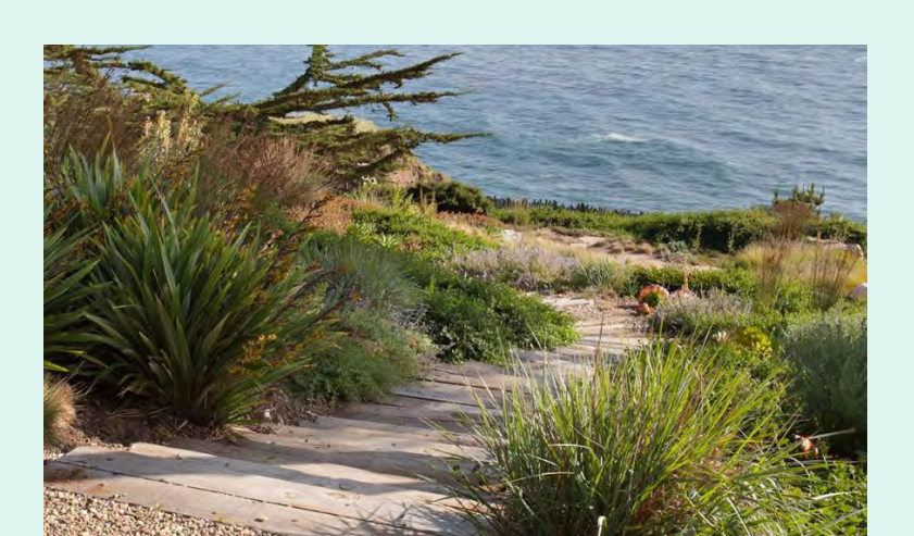
Retaining open views out to sea.