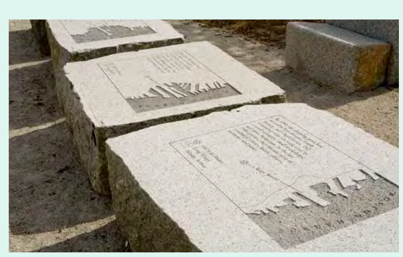
Inscriptions into large stones.