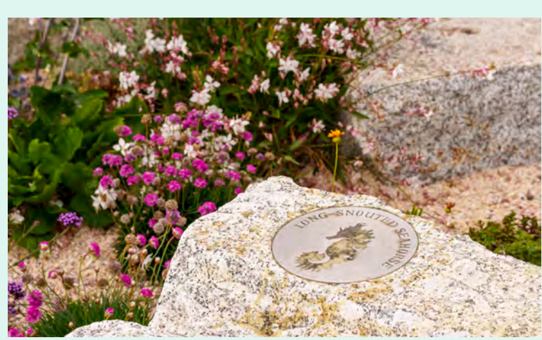
Local interpretation integrated into boulders or seating.