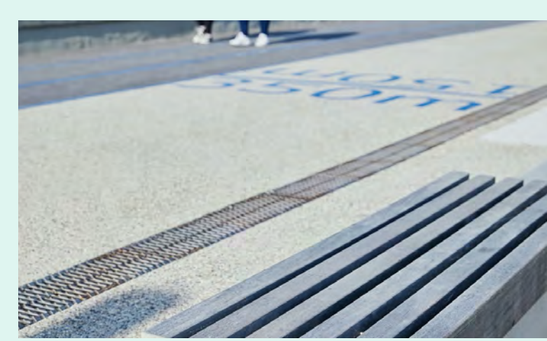
Simple timber top seating.