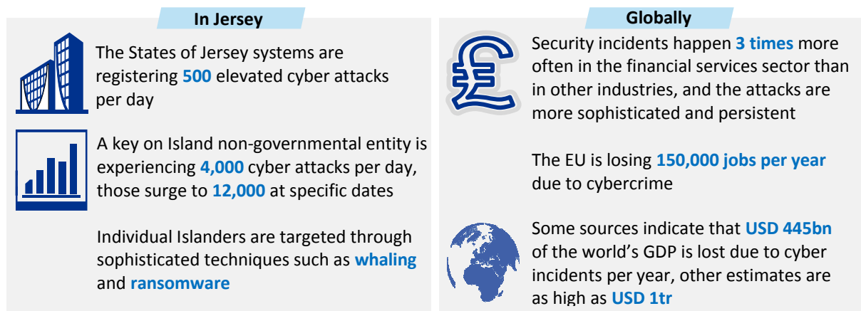
Figure 3: Threat landscape in Jersey and globally 4

Jersey faces similar cyber security threats to those faced by most advanced economies and the frequency and sophistication of cyber attacks is increasing. Given this context, like other jurisdictions, we need to continue to strengthen our defensive capabilities and cyber resilience.