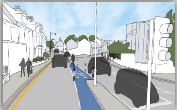
Georgetown junction allowing safer access for cyclists