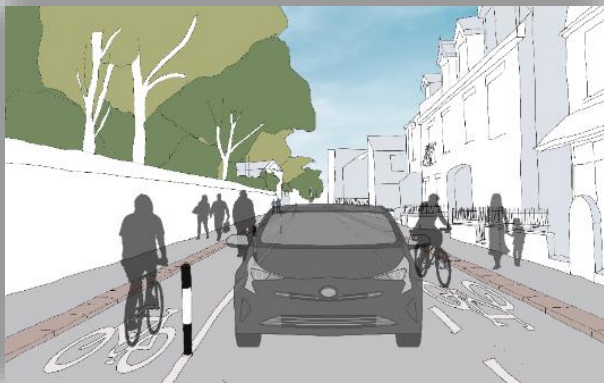
Eastbound Don Road with cycle lanes in both directions

As part of the campaign to reduce carbon emissions, active travel can reduce car use and energy consumption. By encouraging more people to commute into town by cycling and walking, thereby reducing traffic and congestion, there is less pollution and better health outcomes.