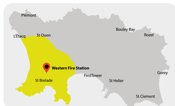
10 min response radius to Western Fire Station