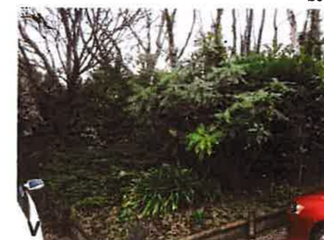
existing parking off la rue des varvots (V and W)