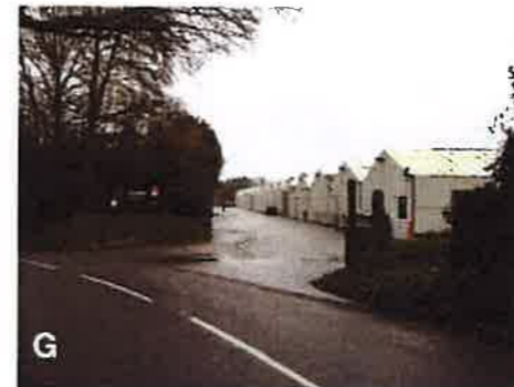
G: existing horizontal mass of existing glasshouse dominant on presentation to public realm of La Rue de la Frontiere