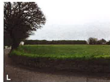
L: extensive perimeter screening presented to public realm of La Rue de la Frontiere