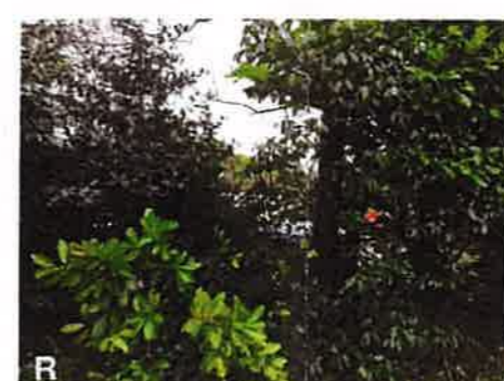
R: limited gaps in existing boundary landscape can be simply reinforced with additional planting as 'S'