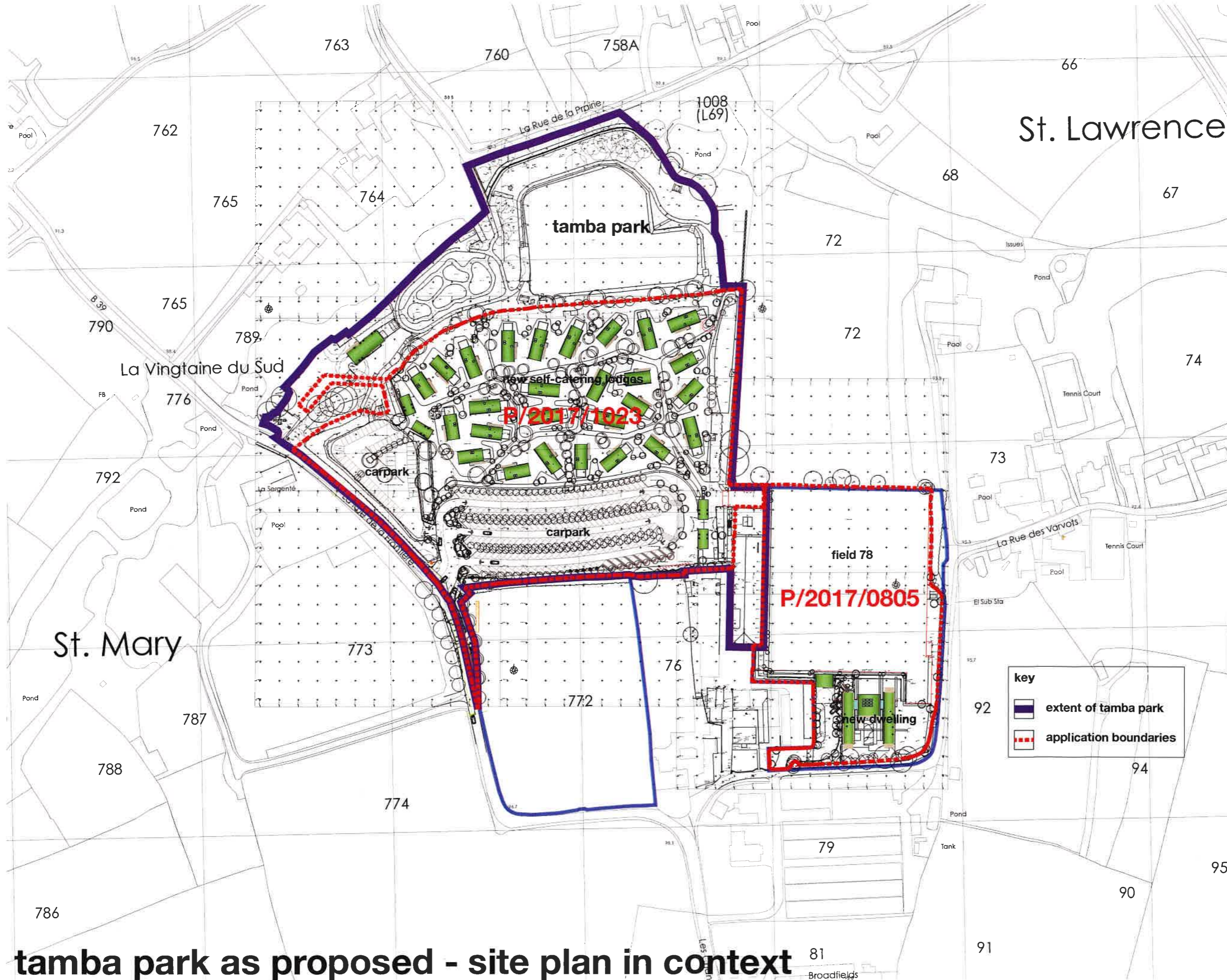
tamba park as proposed - site plan in context

notes figured dimensions only are to be taken from this drawing all dimensions are to be checked on site before any work is put in hand, if in doubt seek confirmation this drawing must be read in conjunction with all other architects detail drawings, schedules and specifications all drawings are to be read in conjunction with relevant drawings from other consultants, in case of inconsistencies seek clarification this drawing must not be copied in whole or in part without the prior written permission of origin architecture studio copyright - origin architecture studio