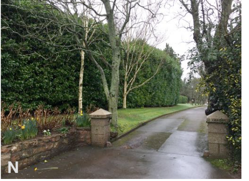
la rue des varvots (N-U)