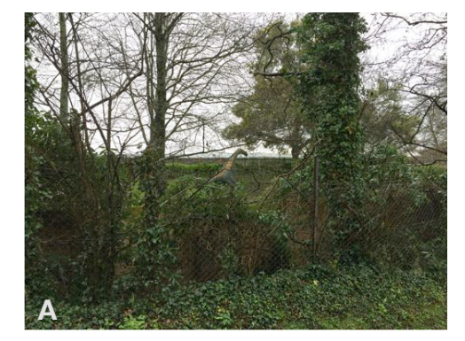
la rue de la prairie (A-C)