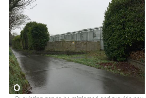
O: existing gap to be reinforced and provide new access to reinstated field L78