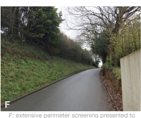
extensive perimeter screening presented to public realm of La Rue de la Frontiere