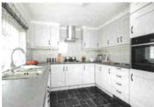
Fittings & Equipment