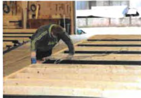
Floor (Standard Construction)