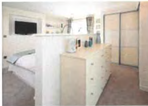
Kitchen Cabinets, Wardrobes, Cupboards & Bedside Units

Enquiry / Brochure Request » Request a brochure