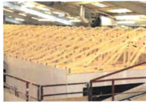
Roof (Standard Construction)