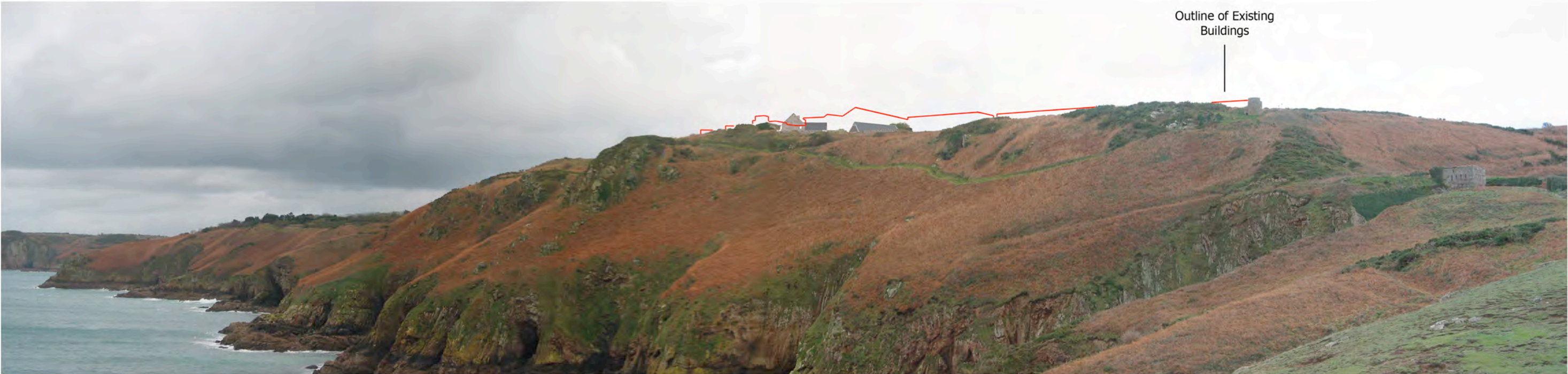
Outline of Existing Buildings

A. Location of houses corrected 15/05/09 MDW