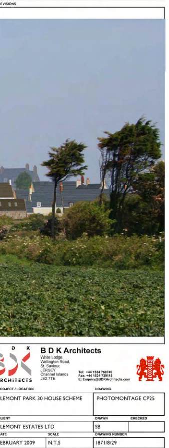
30 House scheme

THIS DRAWING AND ALL DESIGN AND DETAILS ARE THE COPYRIGHT OF CHANNEL ARCHITECTS LTD. This drawing must be read in conjunction with all other drawings, details and specifications issued by the Architect, Structural Engineer and other Consultants or approved specialists. Discrepancies between any other drawings, details and/or specifications must be referred to the Architect for verification at least 7 days prior to commencement of the work. It is the Contractor's responsibility to ensure all work is carried out in accordance with all statutory requirements and to the approval of the Building Control Officer. All roof and structural timbers are to be vacuum preservative treated by approved methods before delivery to site. All roof decking or external cladding to be V.P. bonded external grade. All materials to comply with the latest British Standards Specification or to have an Agreement Certificate. The Contractor is responsible for all setting out of the works. Use written dimensions only, do not scale off drawings. All dimensions must be checked on site. If in any doubt refer to the Architect prior to commencement of the work.