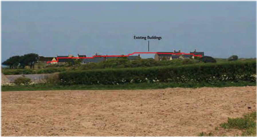
28 House scheme