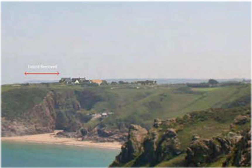
28 House scheme