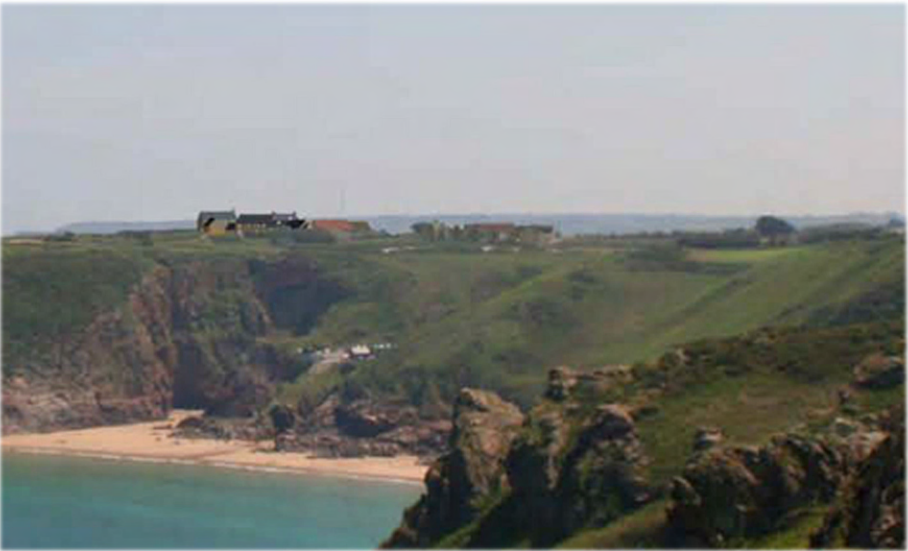
30 House scheme