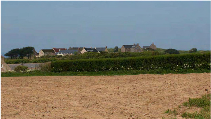
30 House scheme