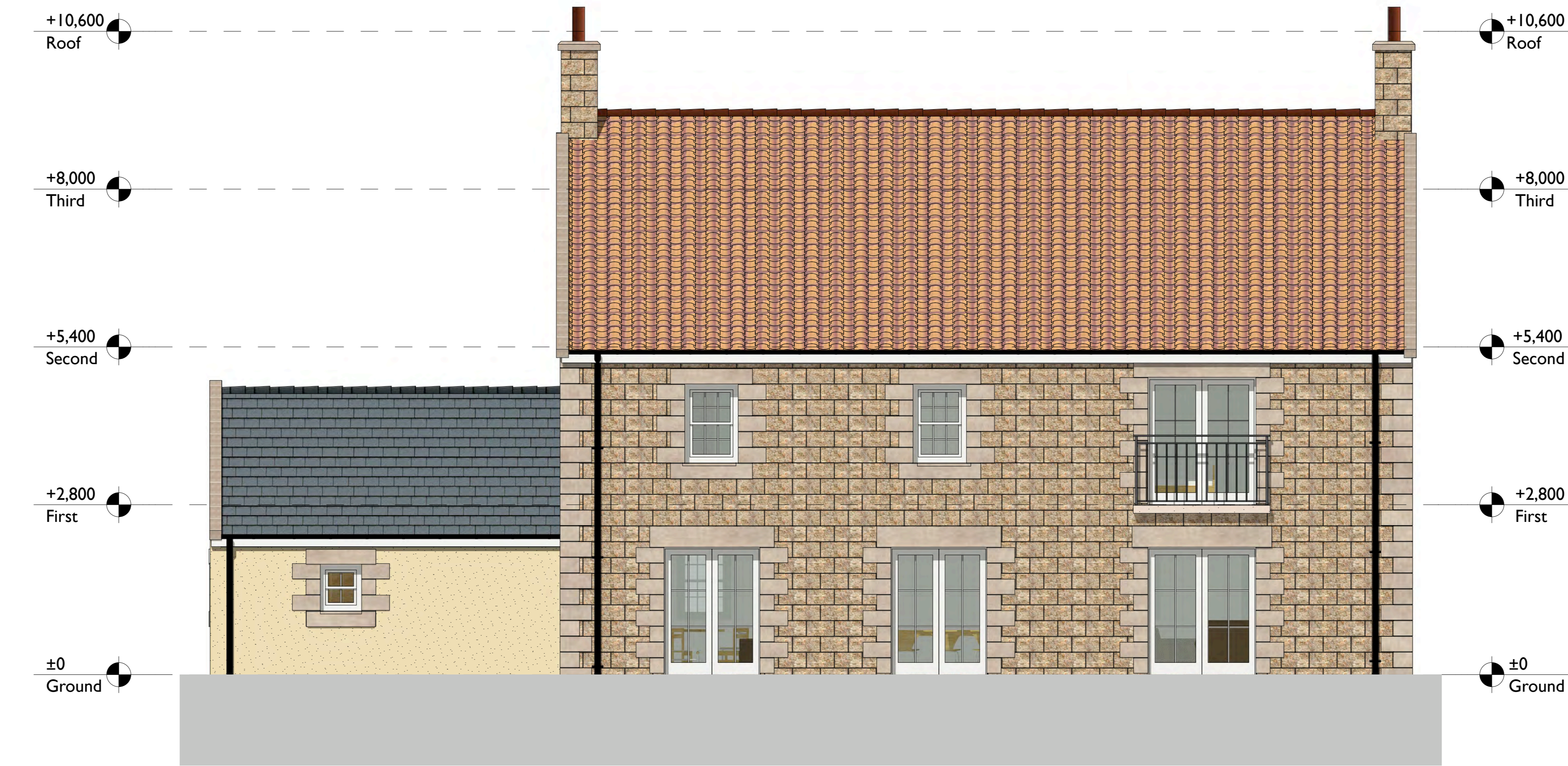
WEST (REAR) ELEVATION 1:50