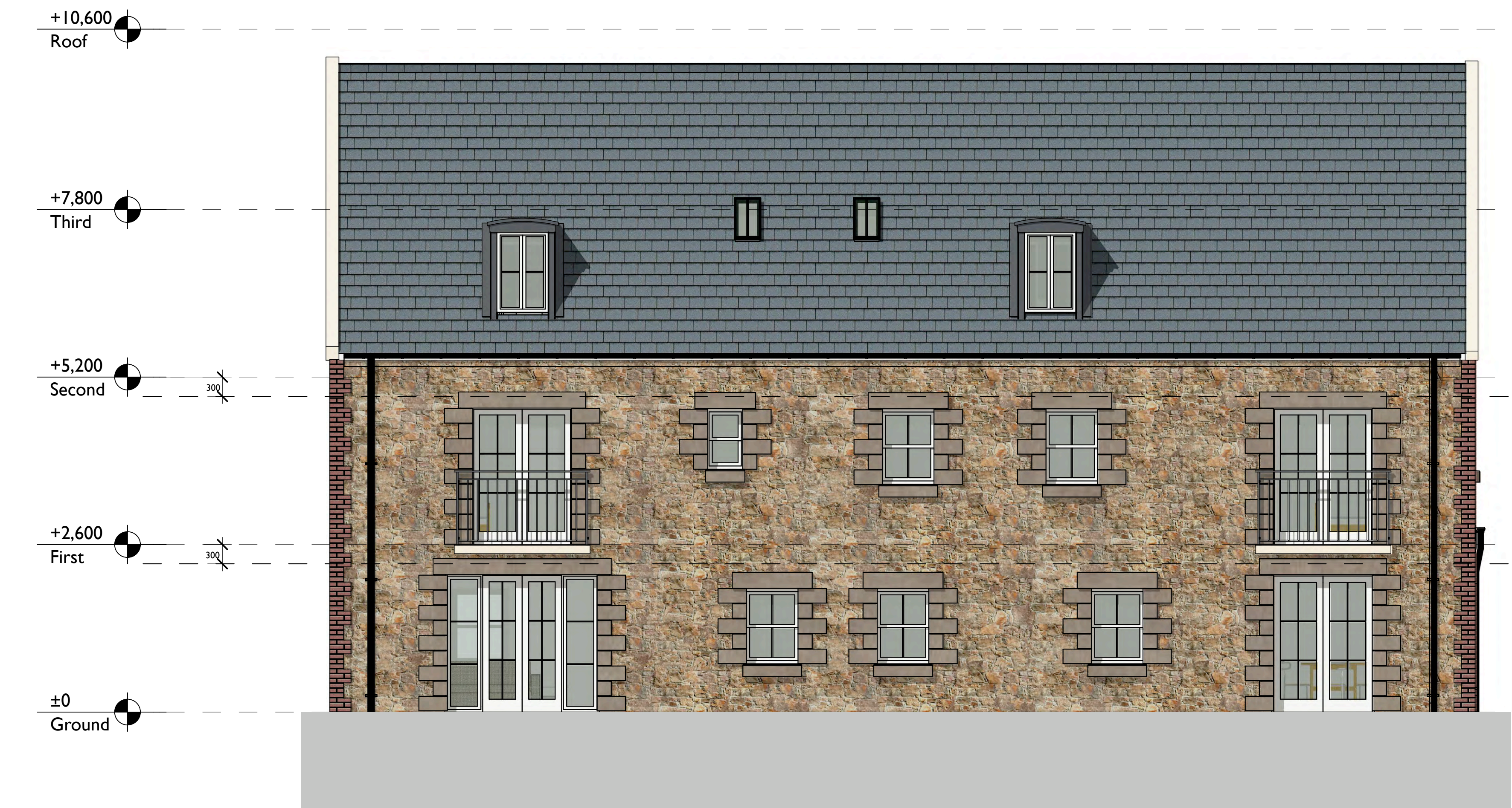
NORTH EAST (REAR) ELEVATION