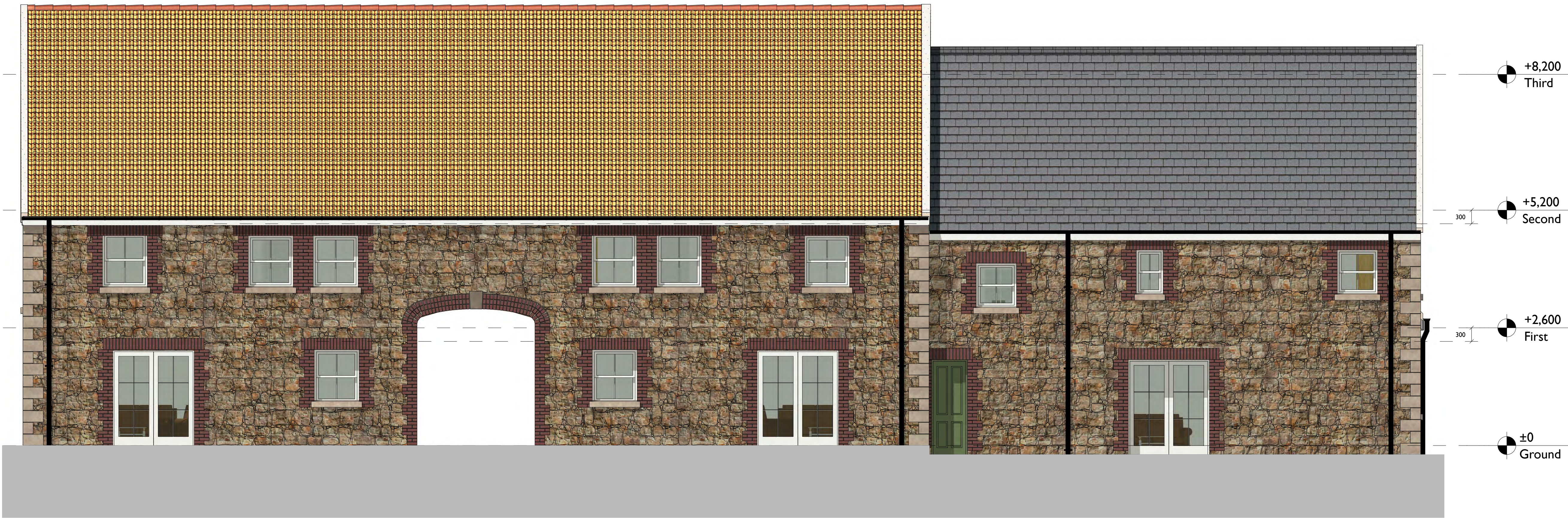
SOUTH WEST (REAR) ELEVATION