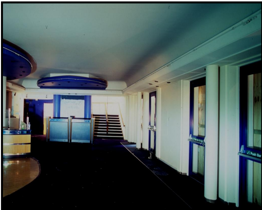
Fig 7. Entrance foyer, 2010