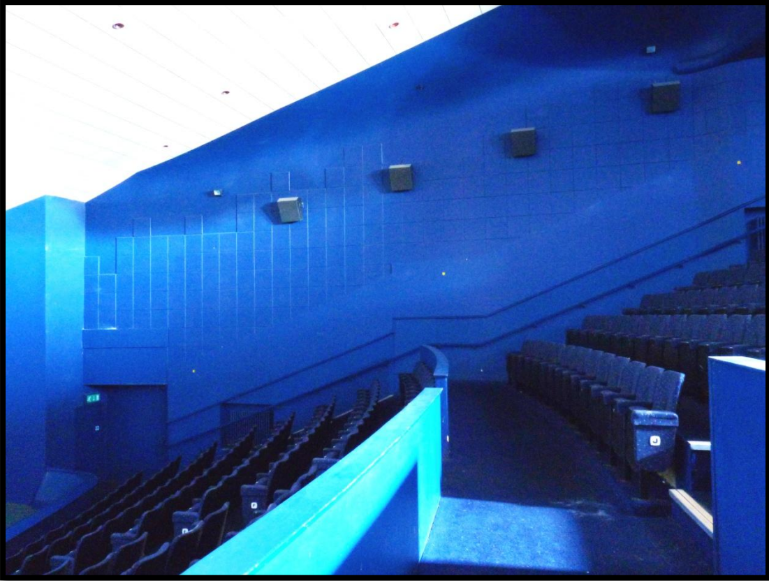
Fig 11. Upper screen/former circle – detail of acoustic tiles, 2010