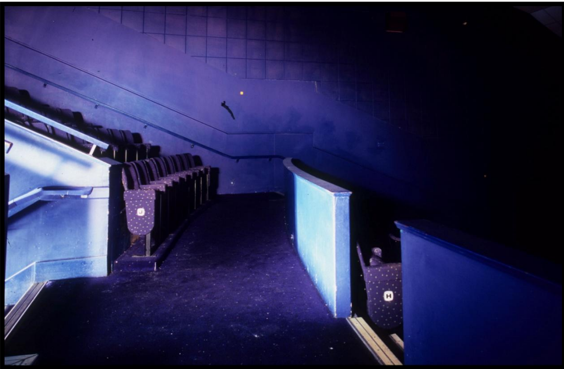
Fig 12. Upper screen/former circle – detail of acoustic tiles and barrier, 2010