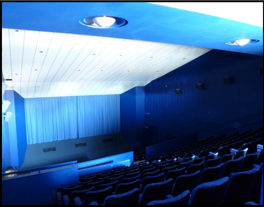
Fig 9. Upper screen/former circle, looking right, 2010