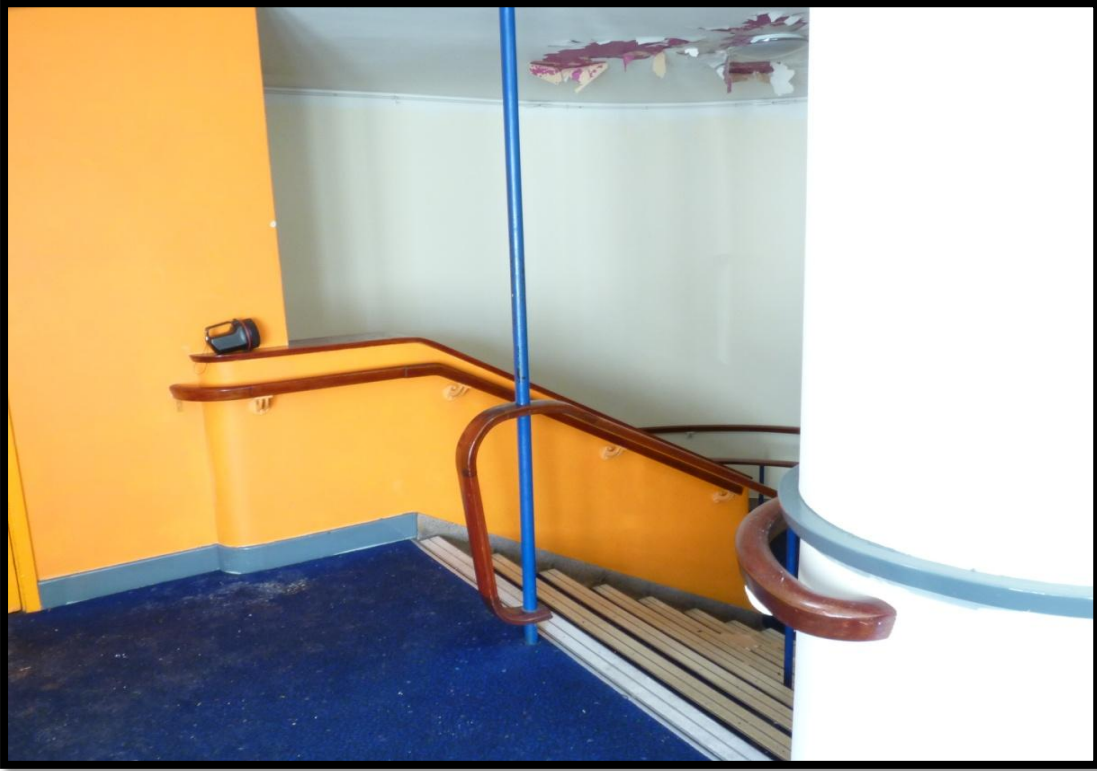
Fig 8. Staircase and handrail (above and below)