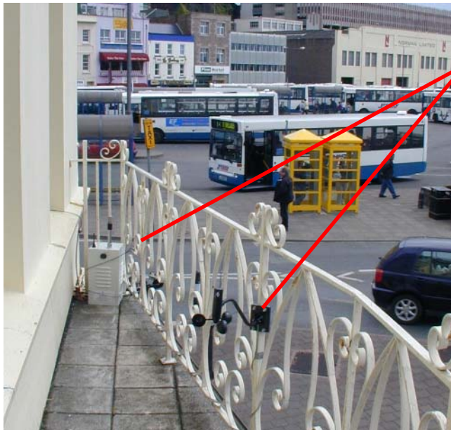
Osiris particle monitor and weather station

It was decided to position the Osiris at this particular site because it has generally the poorest air quality compared to the other monitoring sites. Unfortunately the Public Services Department were not able to provide a traffic monitor at the site. Therefore there is limited data on the speed, volume or mix of traffic using Mulcaster Street. However the Nitrogen dioxide diffusion tube sited on the Police Surveillance tower suggests that the older type buses and taxis contributed to the poor results. It is likely the air quality will improve with the provision of the new Connex buses from 29 th September 2002, which are the cleaner Euro 3 engines.