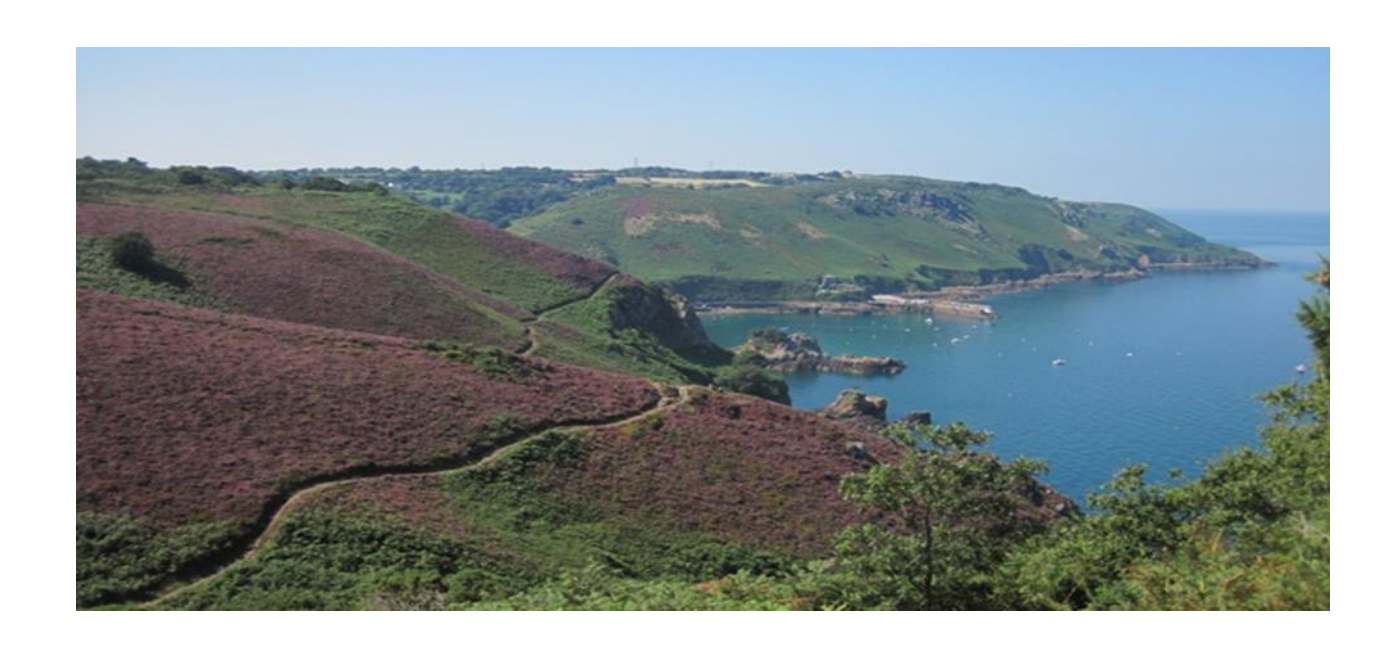
Jersey Coastal National Park – Making a difference