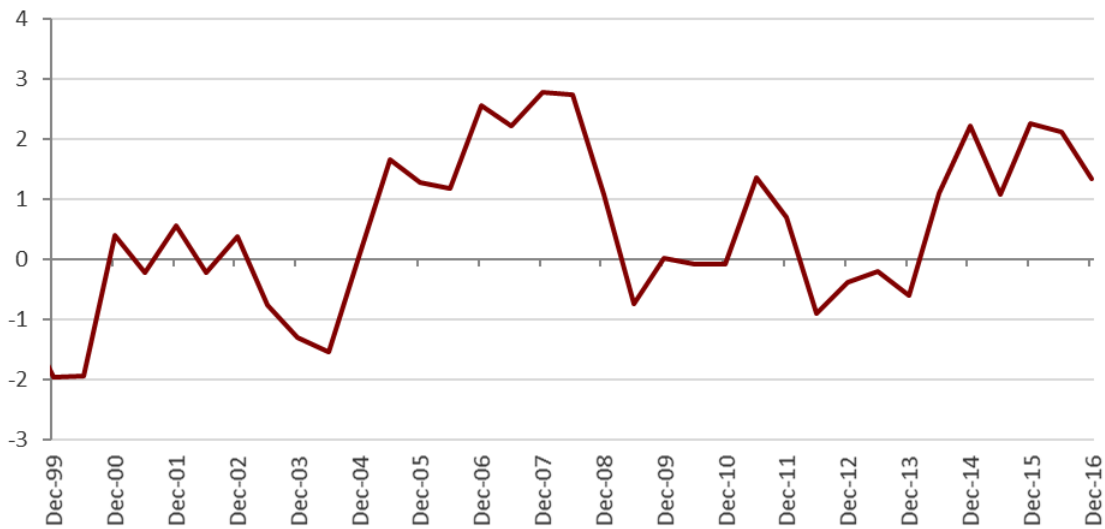
Figure 1 – Annual percentage change in total employment: 1999-2016

Between 2005 and 2008 total employment grew at an annual rate of between 1% and 3%. Over the subsequent four-year period, from 2009 to 2013, total employment was relatively flat, with periods of smaller growth and decline.