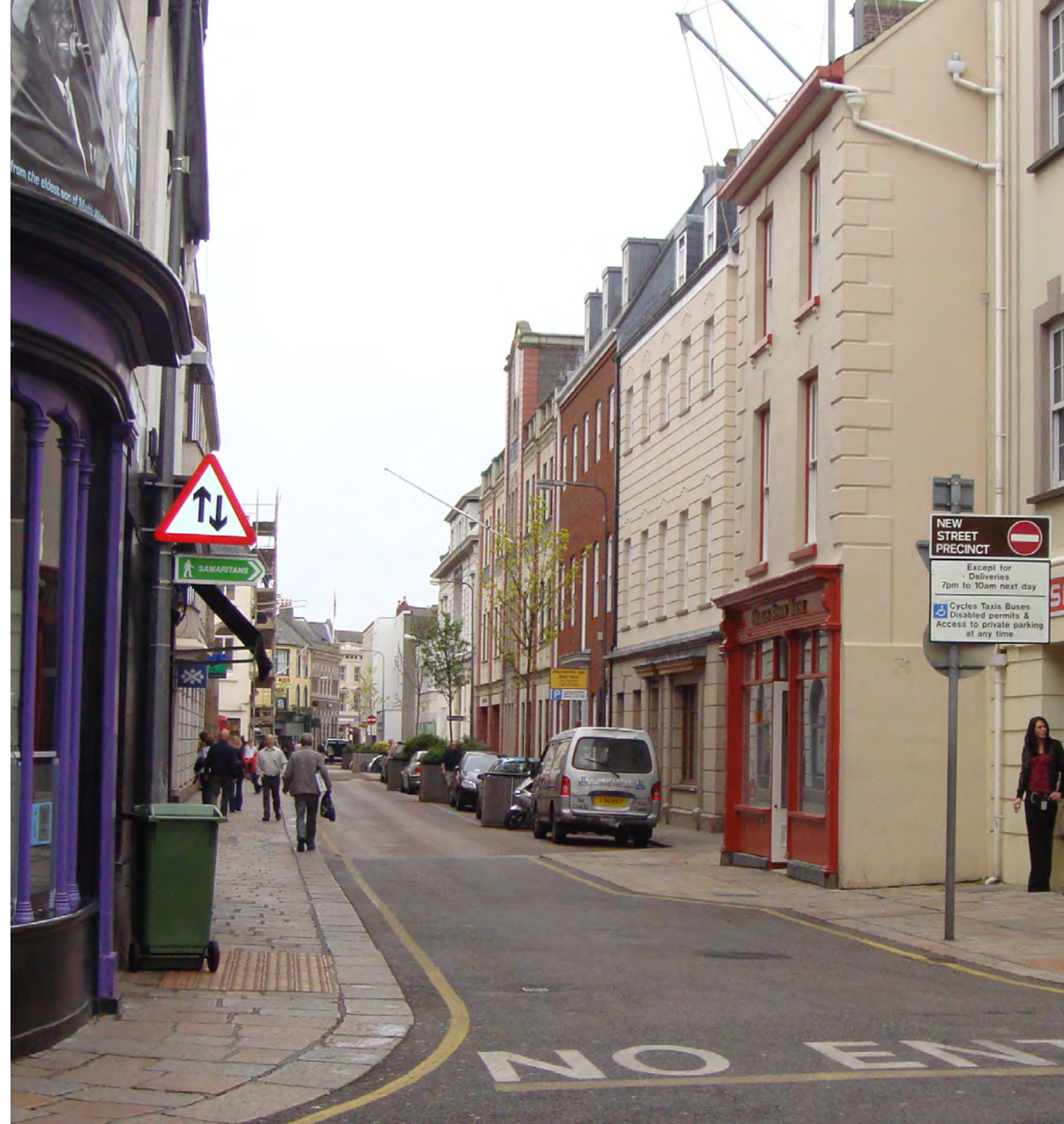
Delivery vehicles on Bath Street and Minden Place