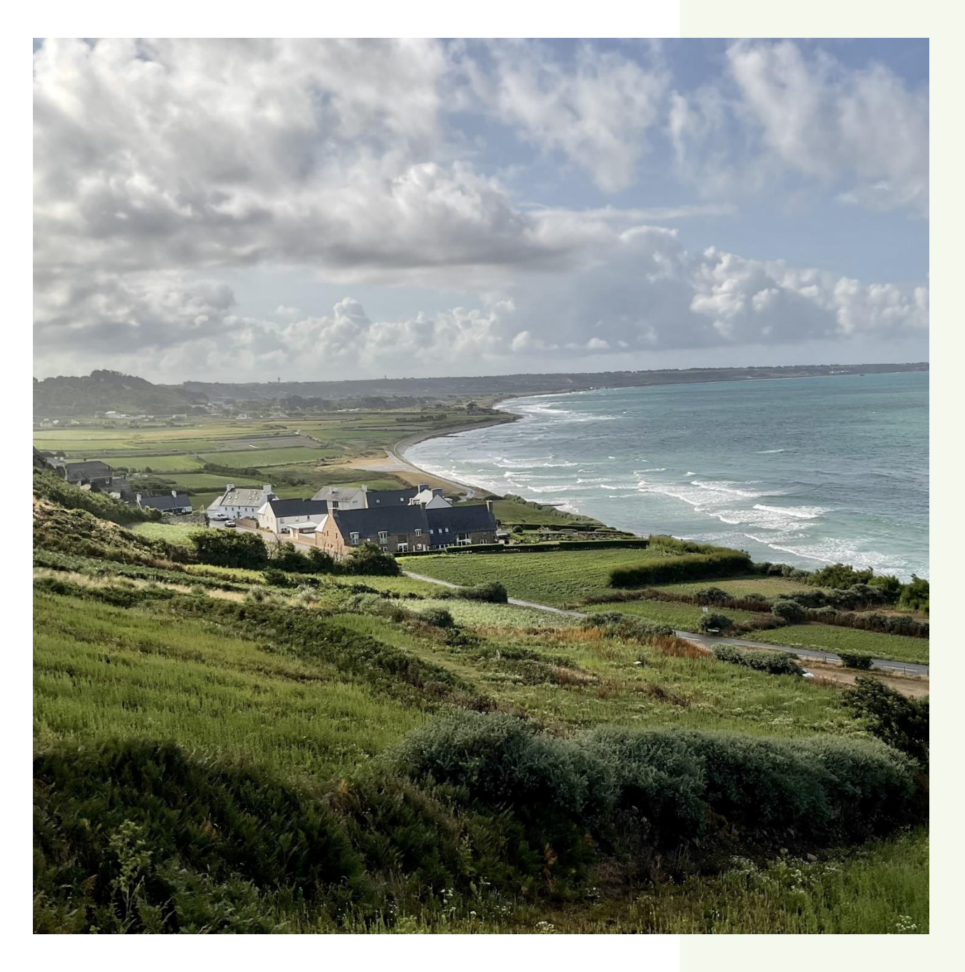
Review of Planning Services (2023) Improvement Plan – 3<sup>rd</sup> Quarter Update