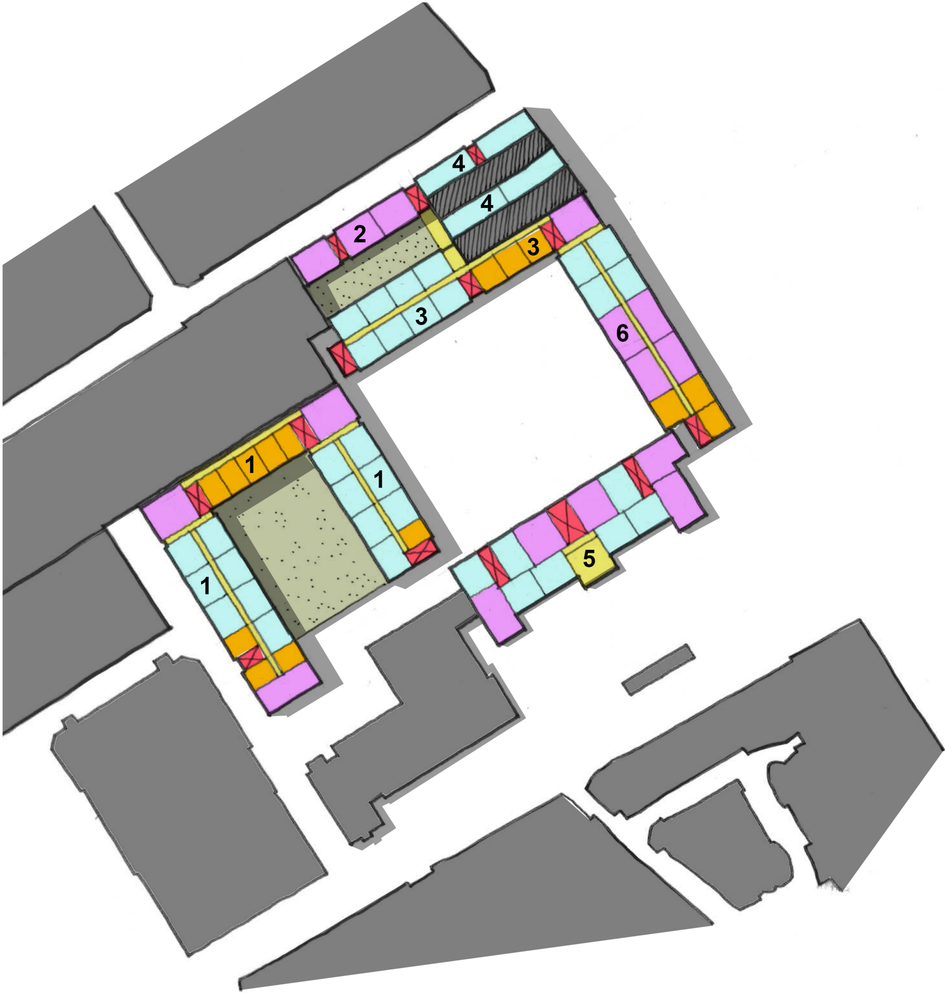
Typical Upper Floor Layout 1:1000@A3