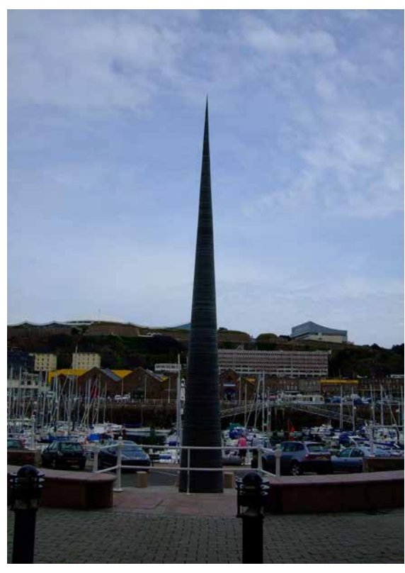
Richard Perry | The Jubilee Needle

Future commissions should extend this legacy with complementary and new approaches, reflecting the developing nature of public art and changes in the demographic of the island. Anecdotal and 'folk memories' for instance can provide artists with inspiration and source material ensuring that the developed work is unique to its site and location, and providing continuity for the island's mixed population through change.