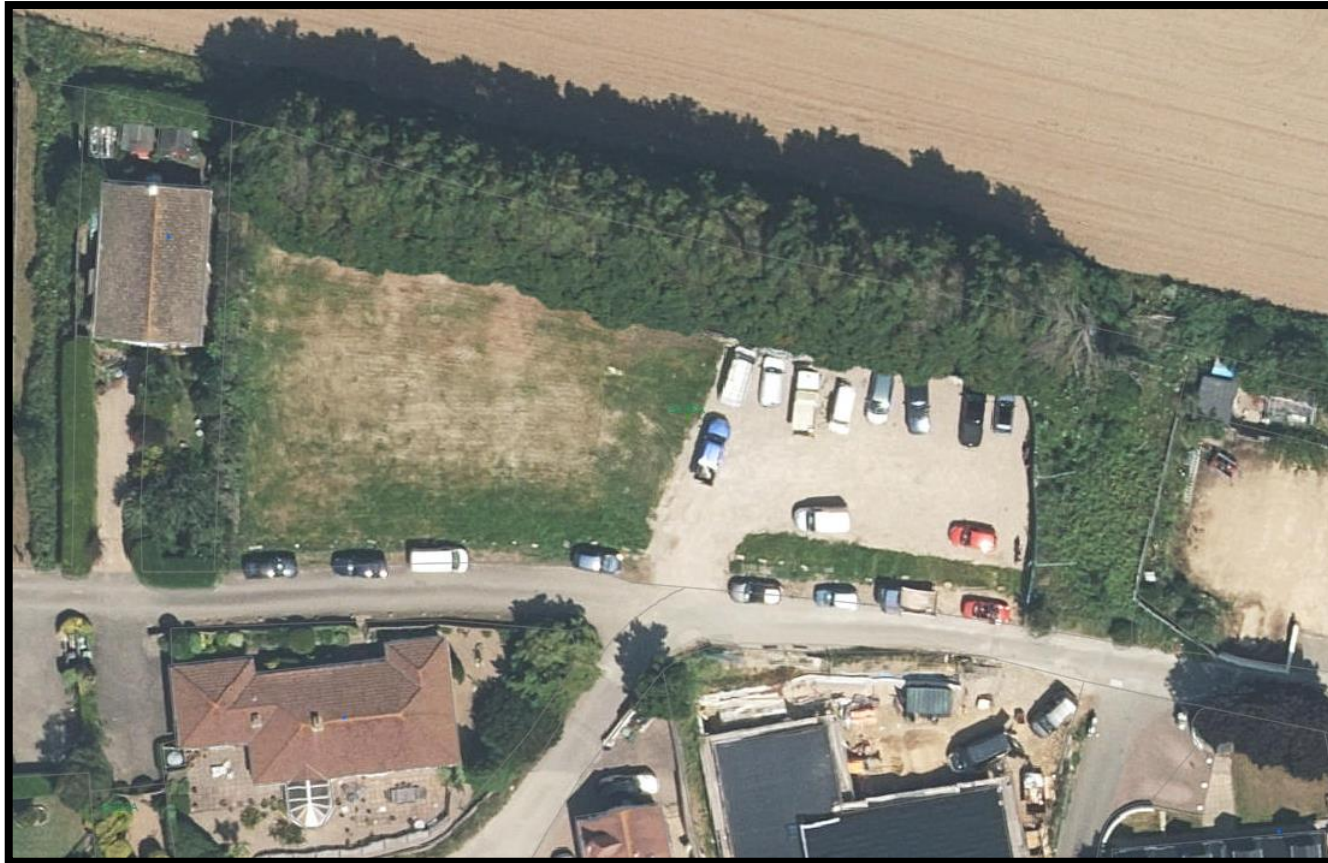
Aerial Image of Field B248A – 2021