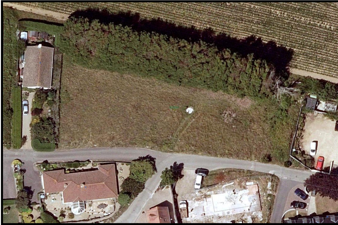
Aerial Image of Field B248A – 2020