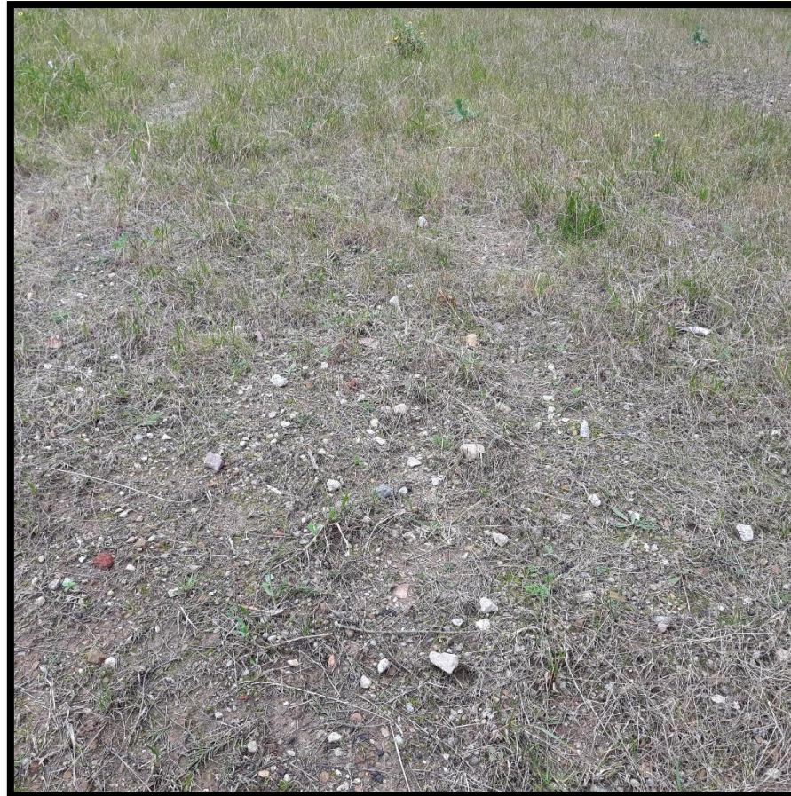
Figure 7 Field B248A (Western End after Reinstatement) Recorded on 01.02.2022