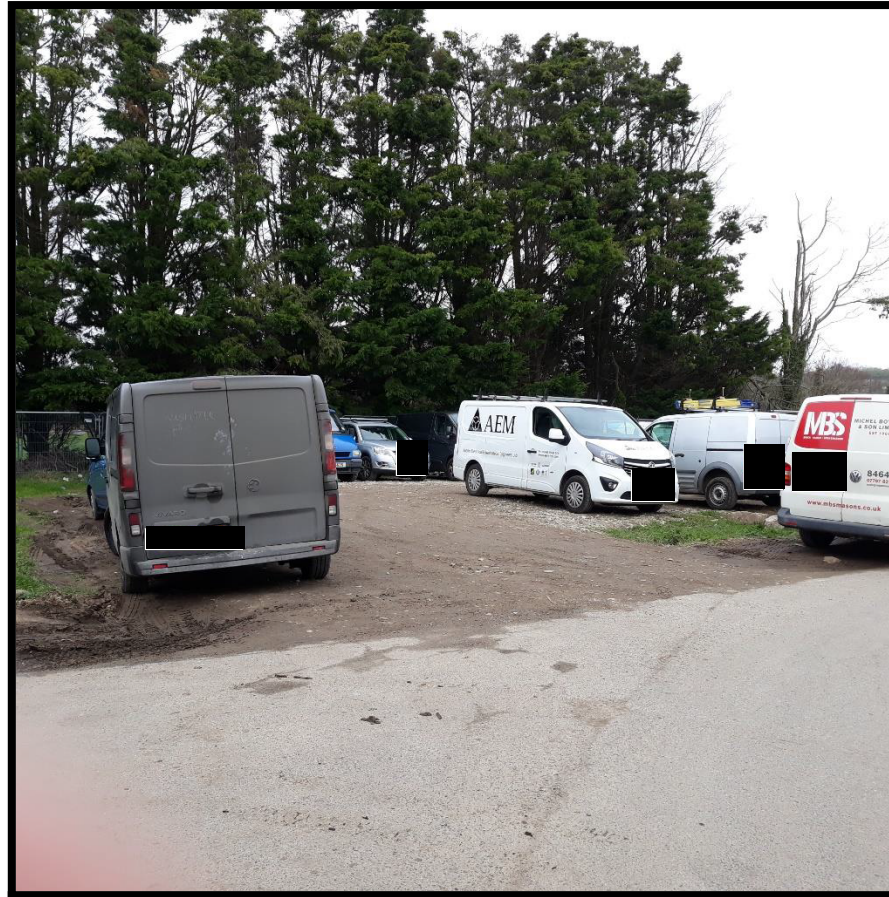
Figure 8 Field B248A (Vehicular Entrance and Eastern End) Recorded on 01.02.2022