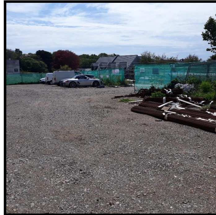
Figure 4 Field B248A (Eastern End) Recorded on 28.05.2021