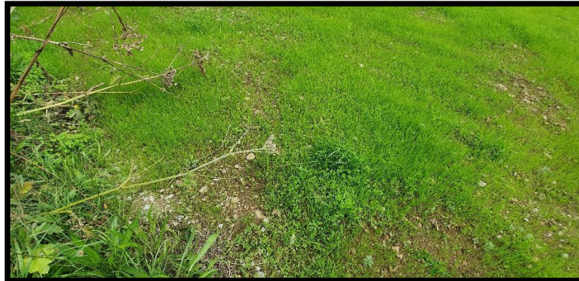
Figure 6 Field B248A (Western End after Reinstatement) Recorded on 07.07.2021