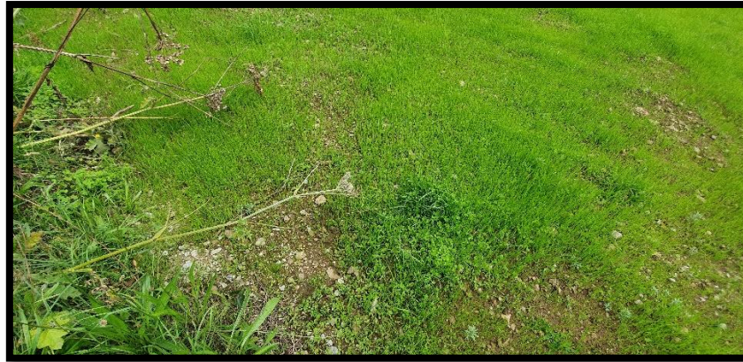
Figure 5 Field B248A (Western End after Reinstatement) Recorded on 07.07.2021