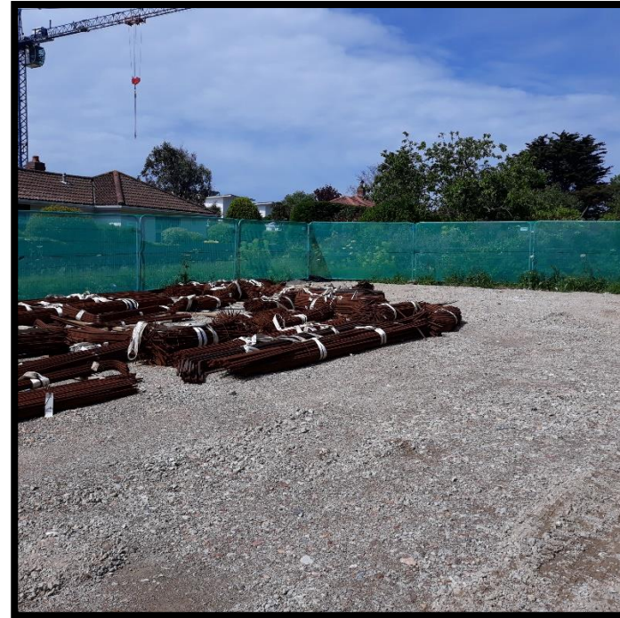
Figure 2 Field B248A (Western End) Recorded on 28.05.2021