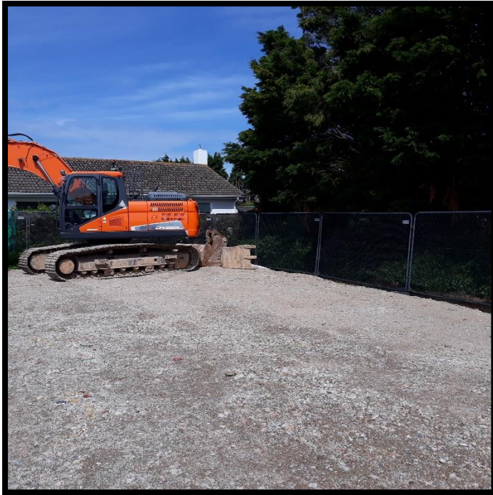
Figure 1 Field B248A (Western End) Recorded on 28.05.2021