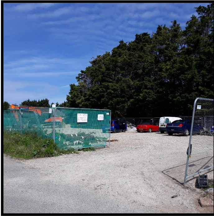
Figure 3 Field B248A (Vehicular Entrance) Recorded on 28.05.2021