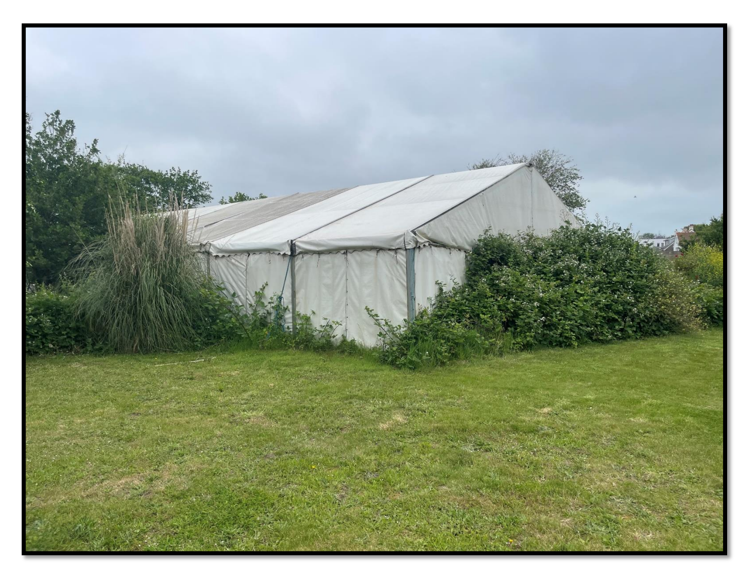
Marquee located upon the land to the East of Eastern Joinery Works, (UPRN 69142999) Cleveland, La Rue de Samares, St. Clement, JE2 6LZ