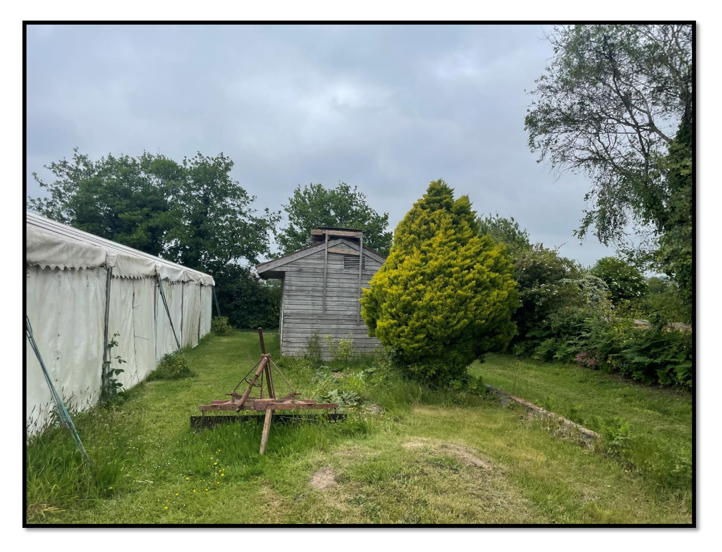
Wooden Store located upon the land to the East of Eastern Joinery Works, (UPRN 69142999) Cleveland, La Rue de Samares, St. Clement, JE2 6LZ