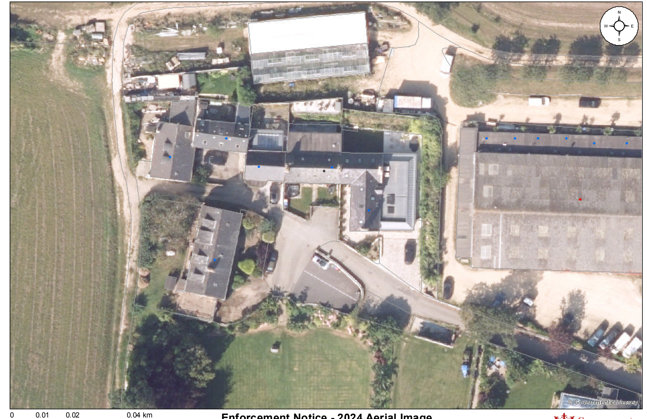
Enforcement Notice - 2024 Aerial Image