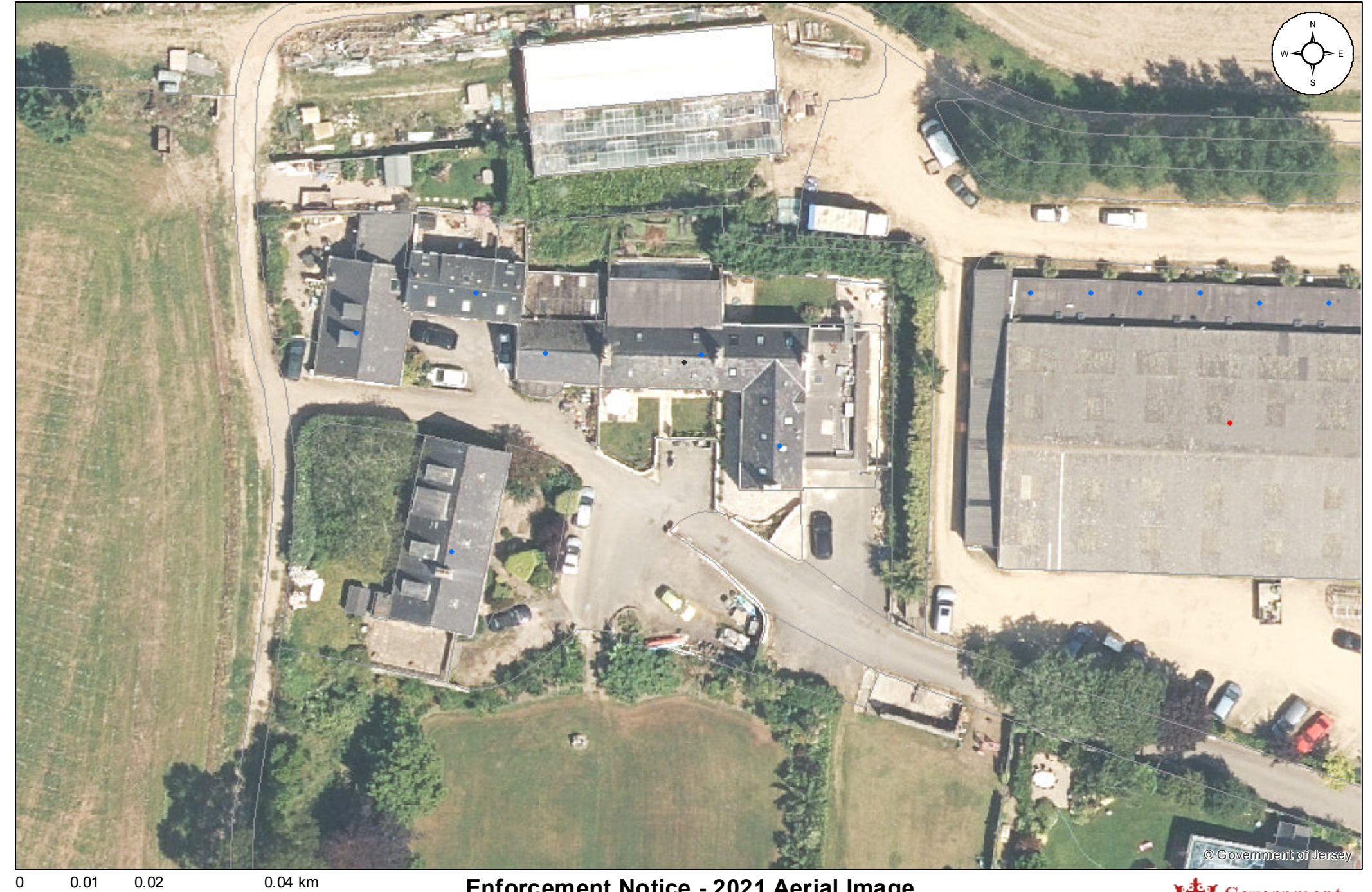
Enforcement Notice - 2021 Aerial Image