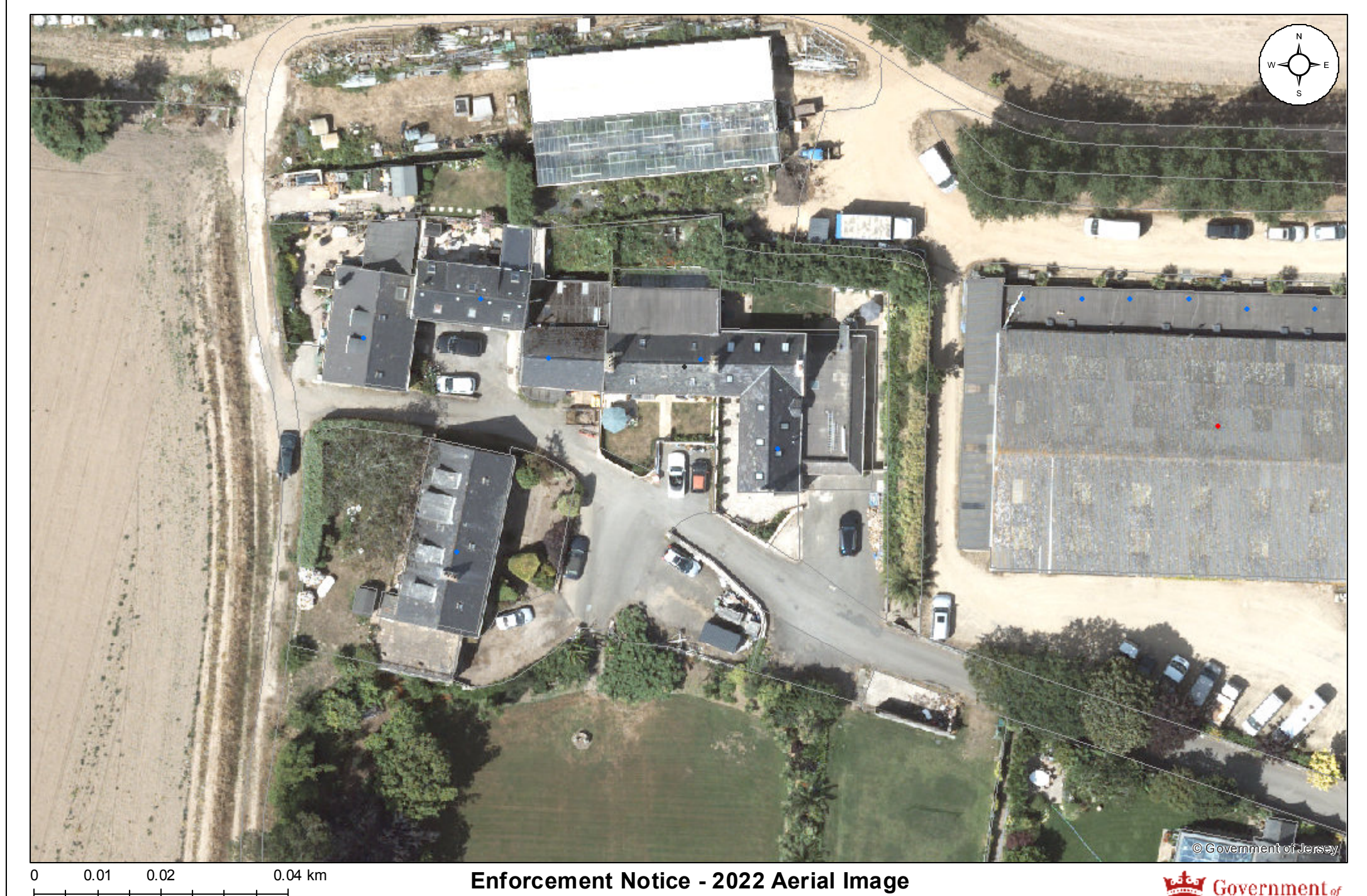
Date: 19/03/2025 SCALE 1:750