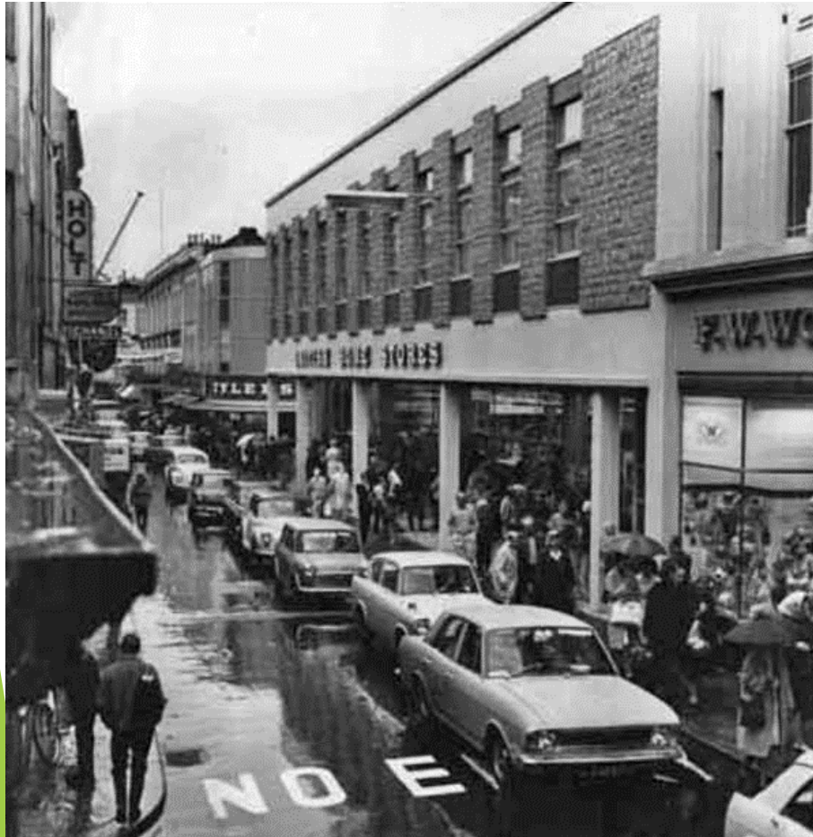
King Street then...