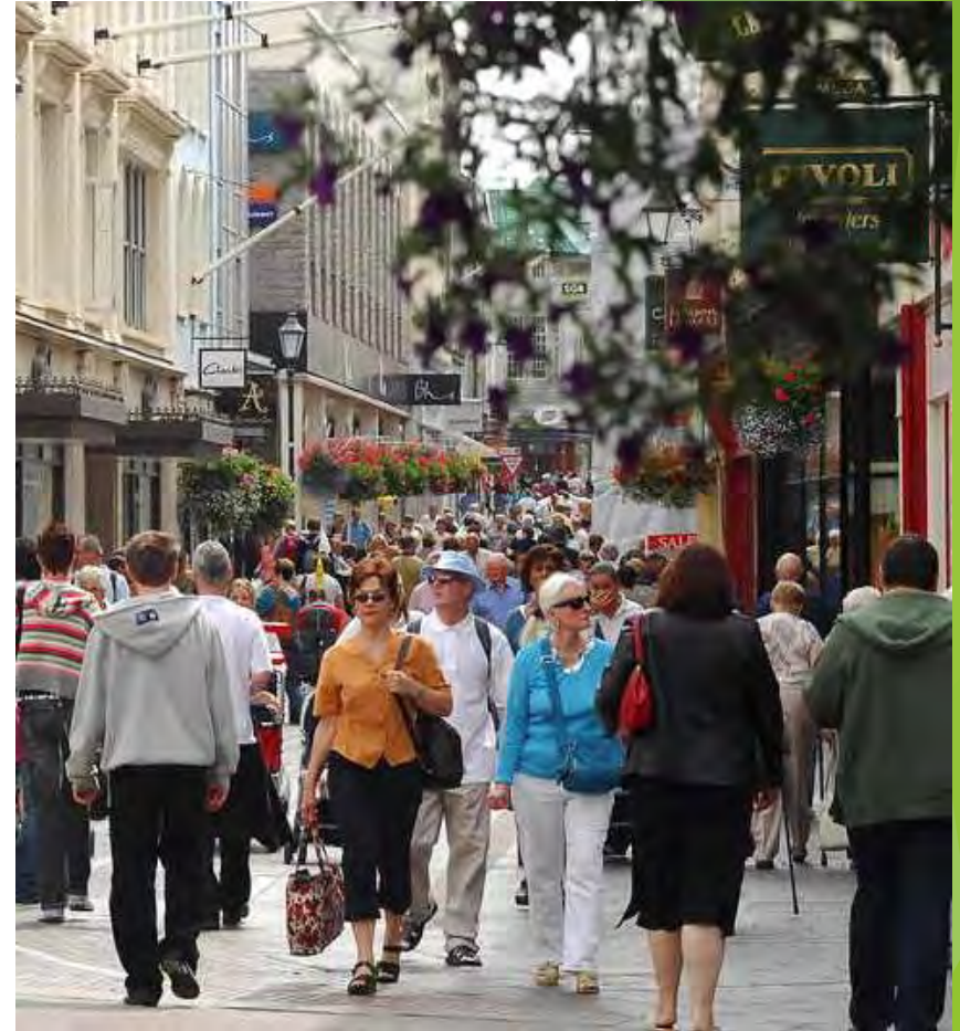
King Street now...