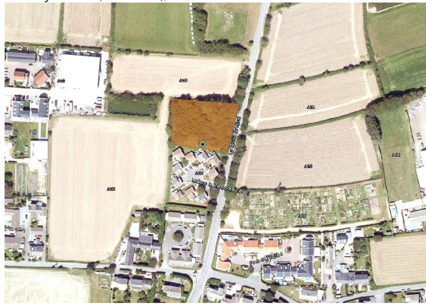
J229 La Route du Nord, St John