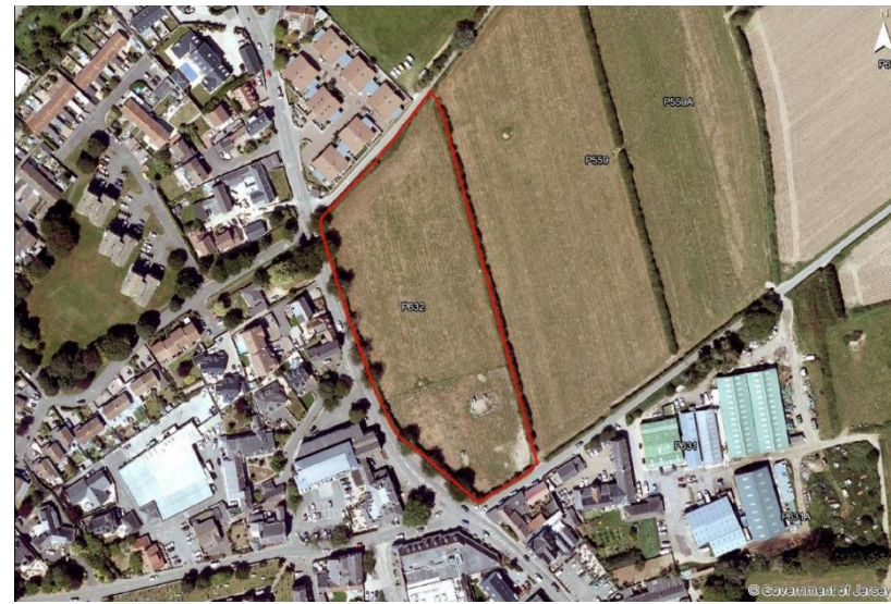
P632 La Route du Marais, St Peter