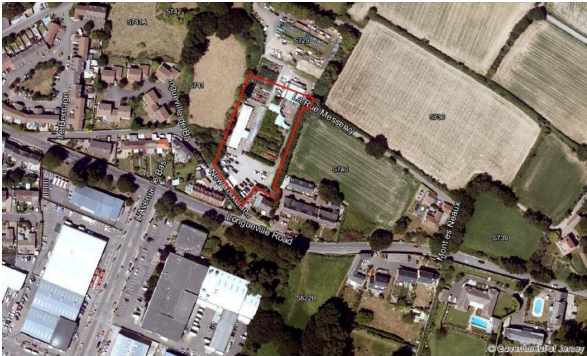
S729 New York Lane, St Saviour