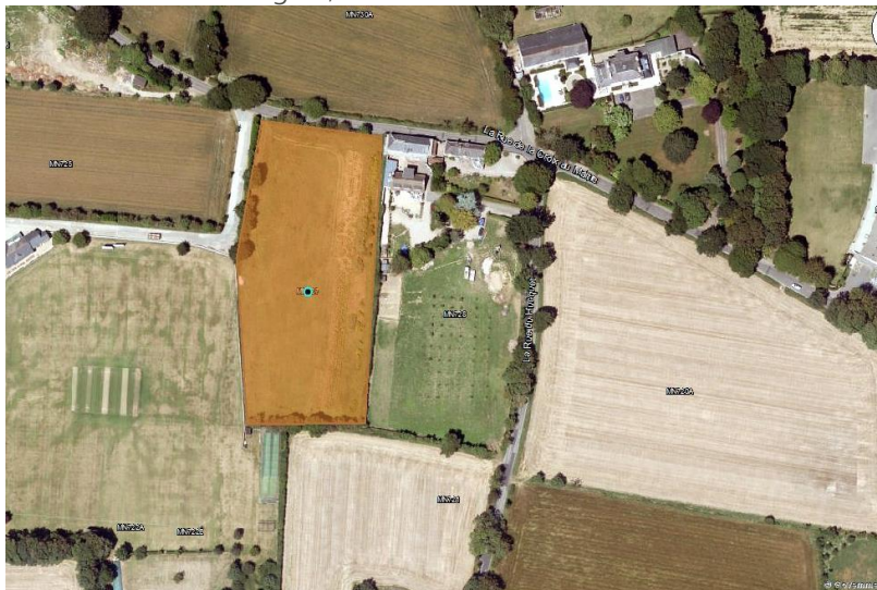
MN727 St Martin La Rue de la Croix au Maître, St Martin