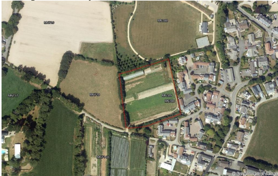
MN389 and MN390 La Rue de la Haye, St Martin