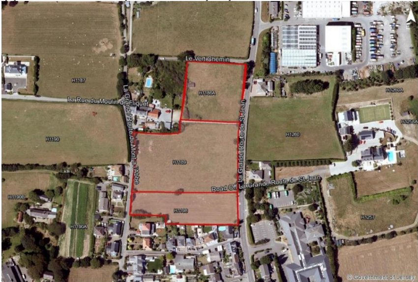
H1186A, H1189, H1198 La Grande Route de St. Jean, St Helier