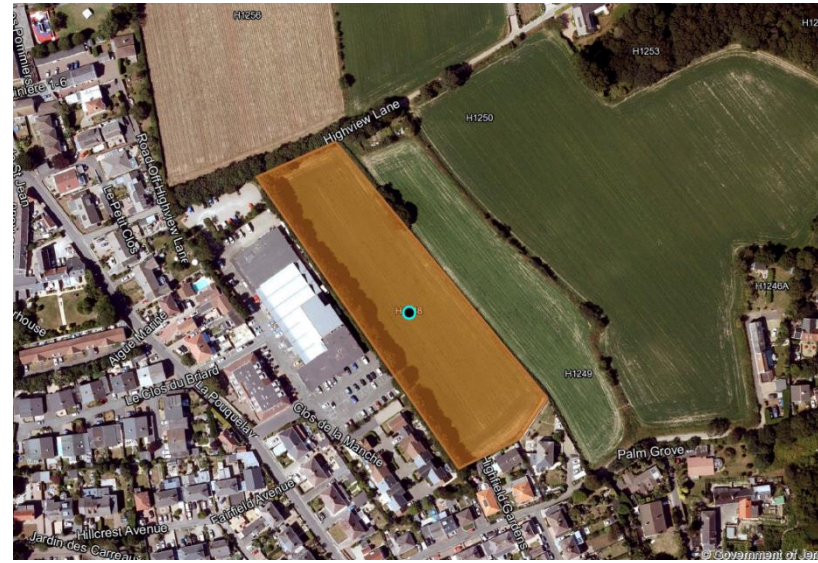
H1248 Highview Lane, St Helier