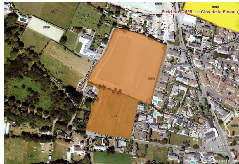
O622 and O623 La Rue de la Croute, St Ouen