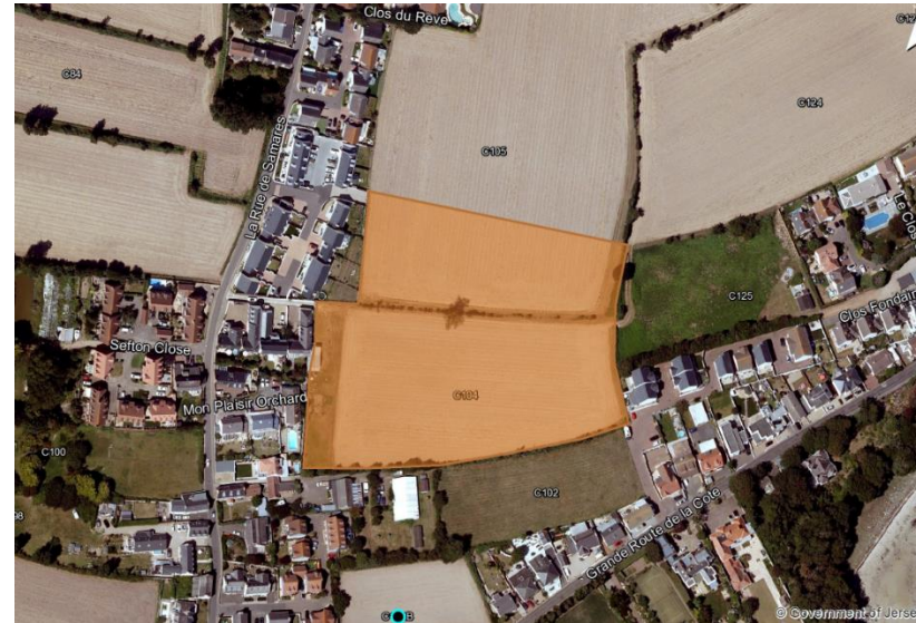
C104 and C105 La Grande Route de la Cote, St Clement