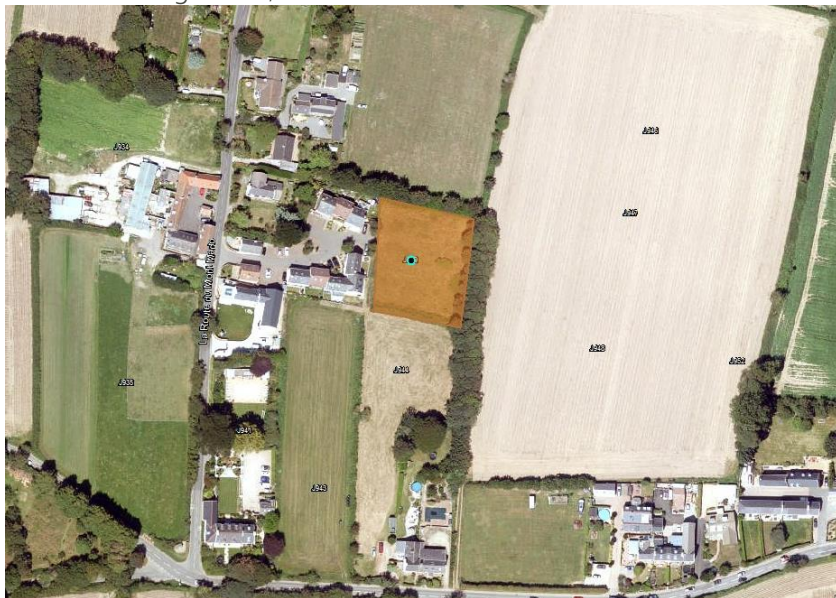
J939 La Route du Mont Mado, St John