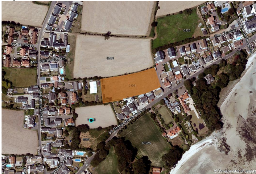
C102 La Grande Route de la Cote, St Clement