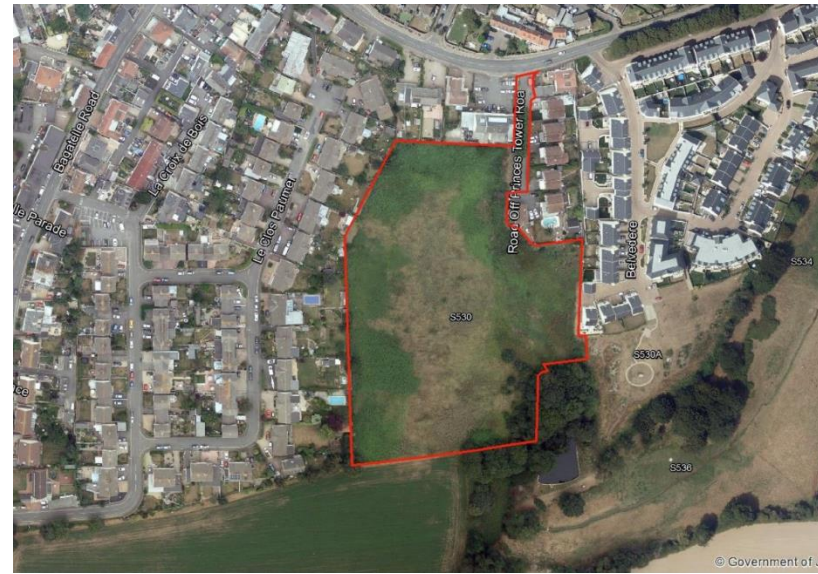
S530 Princes Tower Road, St Saviour