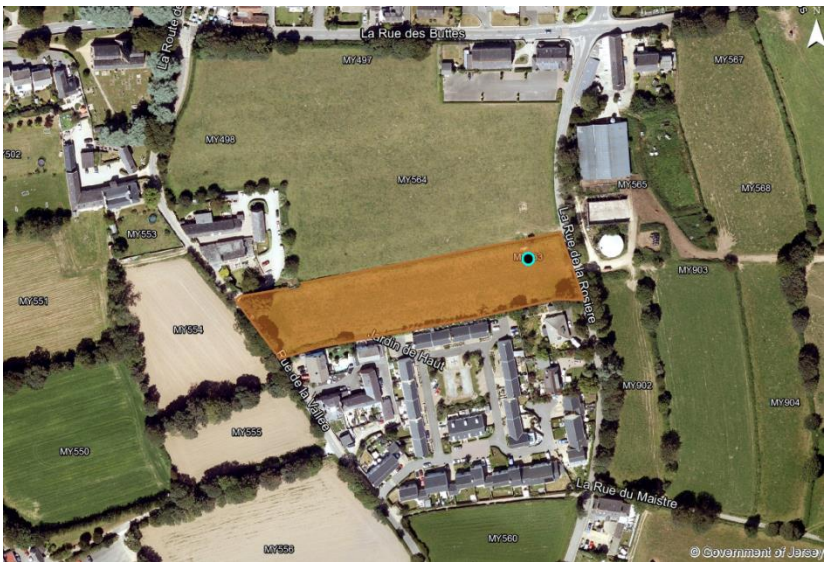
MY563 La Rue de la Rosiere & La Rue de la Vallée, St Mary