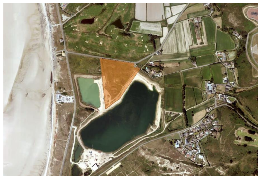
Simon Sand and Gravel Ltd La Grande Route des Mielles, St Peter