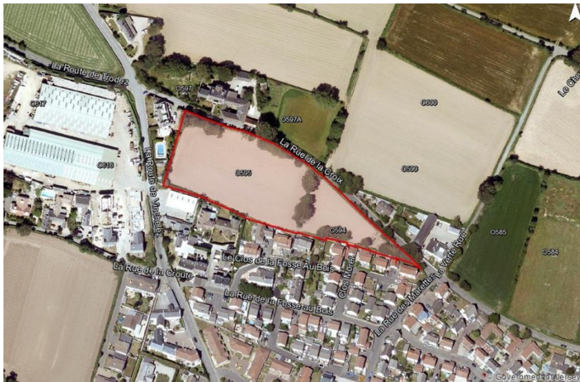
O594 and O595 Le Clos de la Fosse au Bois, St Ouen