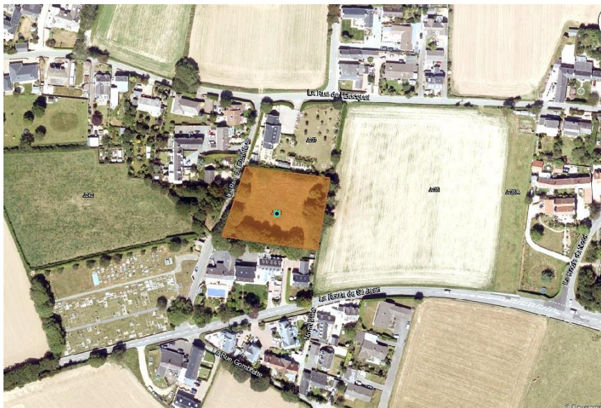
J939 La Route du Mont Mado, St John