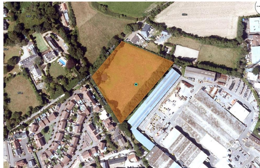
S380 La Rue a La Dame, St Saviour