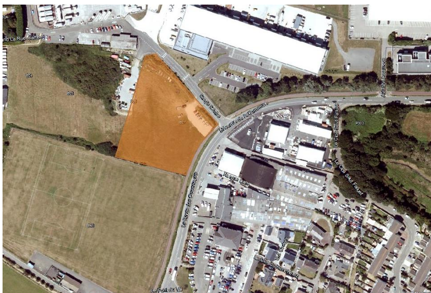
B26 and B27 La Route des Quennevais, St Brelade