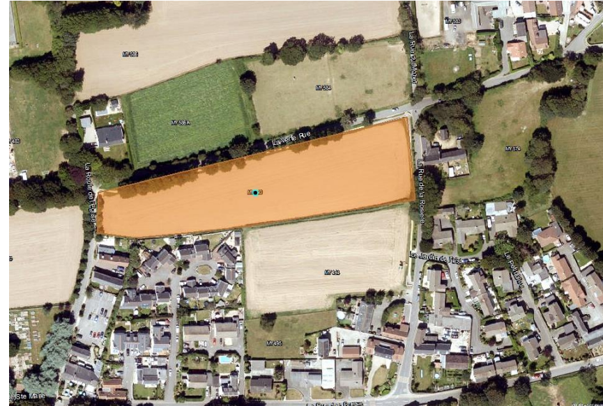
MY493 La Route de L'Eglise, St Mary