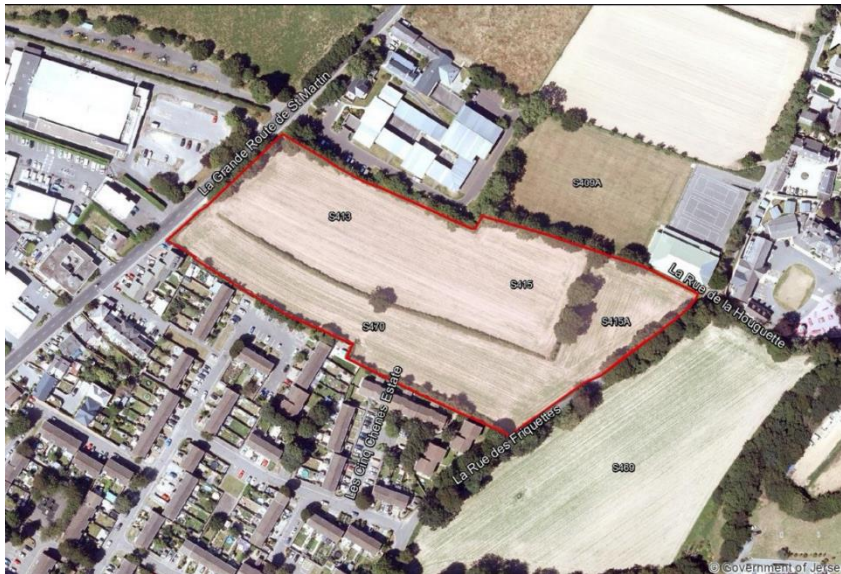
S413, S415, S415A and S470 La Grande Route de St. Martin, St Martin