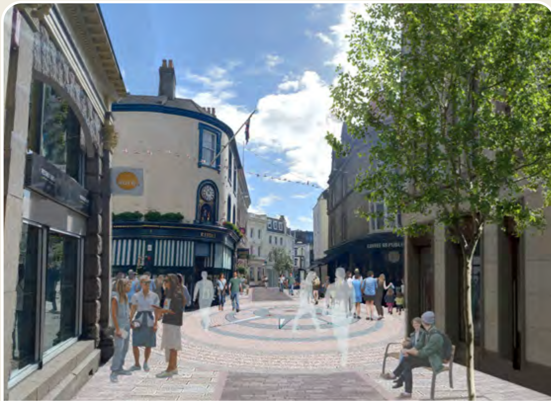
View 1: From New Street