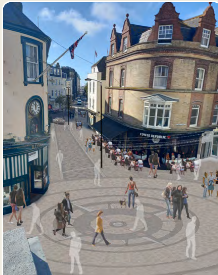
View 3: Over scheme