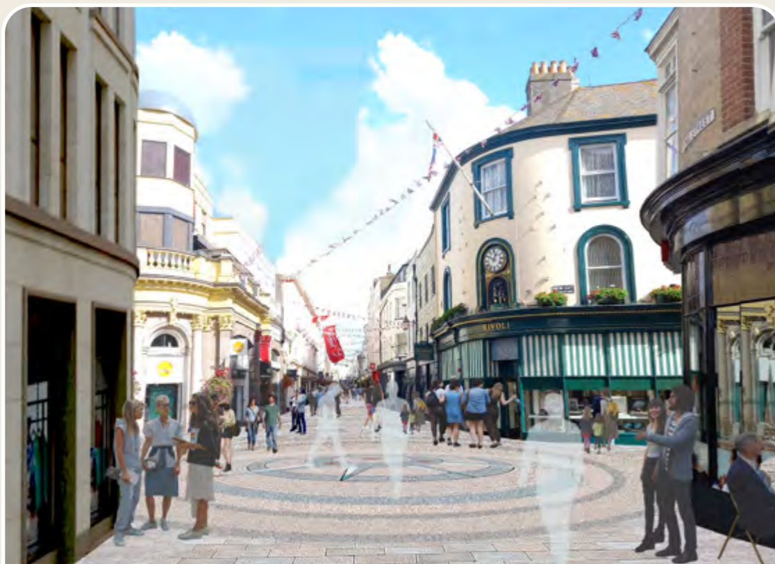
View 2: From King Street