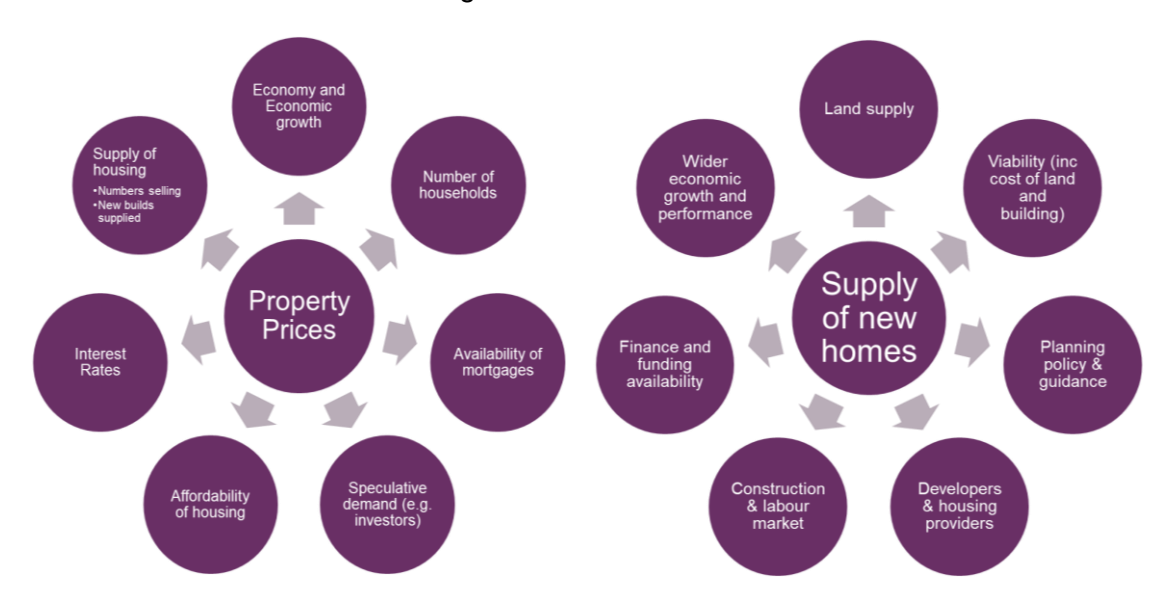
Figure 1: factors affecting property prices and new housing supply

2.3 The supply of new homes is one of several factors that influence the price of property and therefore should be considered alongside the other factors highlighted in Figure 1. Many of the factors influencing property prices can be impacted by government intervention to varying degrees. In the UK national and regional governments have typically directed their efforts to increase the supply of new homes by using both demand and supply side initiatives (e.g. 'help to buy' assistance for first time buyers, better use of public sector land, grant funding programmes for affordable housing).