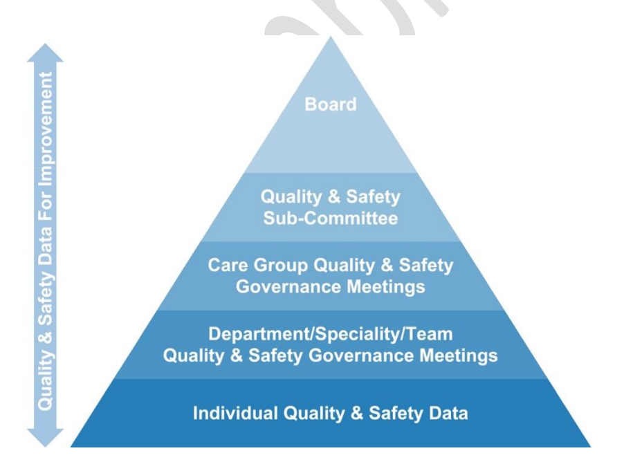
Figure 3. The flow of quality and safety data in HCS

Evidence of challenge regarding quality and safety will be apparent in the minutes of Quality & Safety meetings throughout the organisation; there will be a constant focus on improving person centred care and experiences. Escalation of risk and identifying of control measures will be visible from the frontline services to the Board.