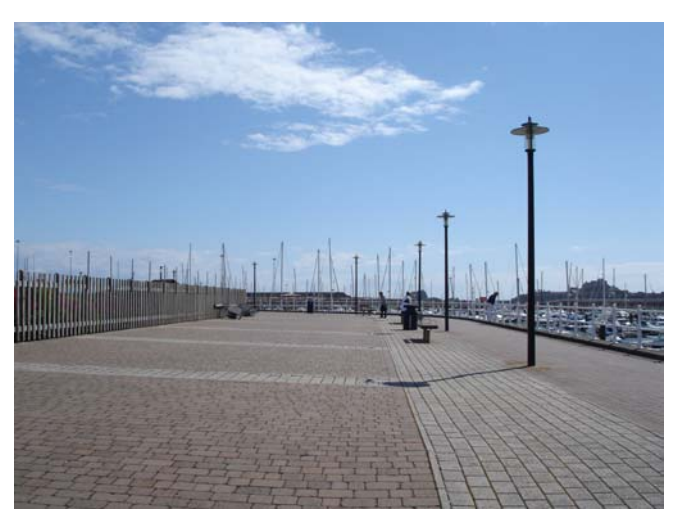
4. From the waterfront to St. Aubin

3. From the waterfront to Elizabeth Castle