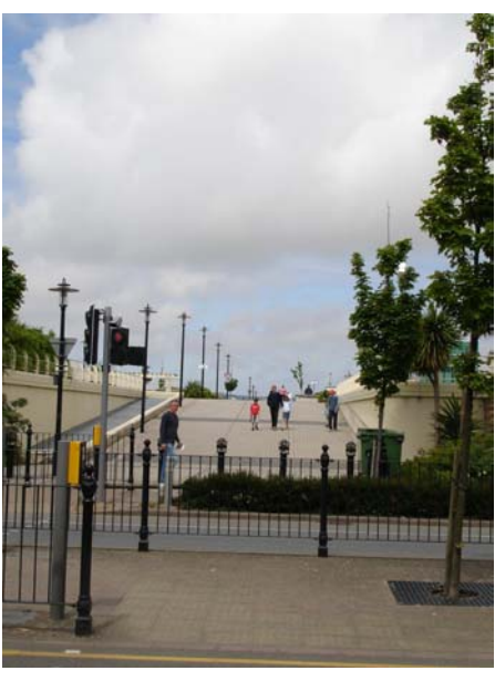
5. From St. Aubin to Fort Regent and Elizabeth Castle