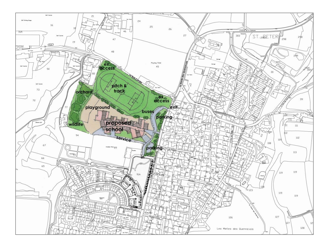
Option 2: Fields south of Rue Carrée

A collection of small fields south of the Airport and Rue Carrée was suggested in 2013 as a potential site for a new school. Environmental, geological, archaeological, acoustic and traffic studies have been carried out and indicate this would be a feasible site. It lies outside Zone 2 of the airport safety area and is shielded from aircraft noise by the departures building and new cargo hangar.