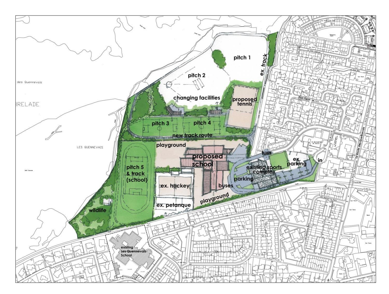
Option 1: South-east corner of Les Quennevais sports field

The search for sites initially concentrated on land that was already owned by the States. There are very few plots that are large enough and/or in the right location. An exception is Les Quennevais sports field. If a school were to be built here it could be located in the south-east corner which is currently the site of the tennis courts and car park. This would place the school next to the Railway Walk and existing sports centre.