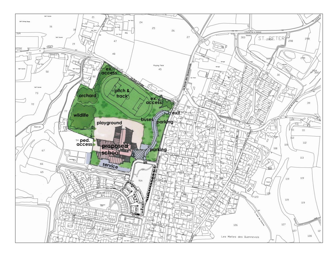
Option 3: Fields south of Rue Carrée plus St Brelade football pitch site

This option has been explored in an attempt to reduce the impact on the fields. The sports pitch and land currently used by the St Brelade Social Club is situated in the Built-up Area rather than the Green Zone. If the school were built here, it would be closer to existing urban development of residential units. The design of the school would have to be adapted to fit onto the pitch but it would mean a smaller incursion onto the fields.