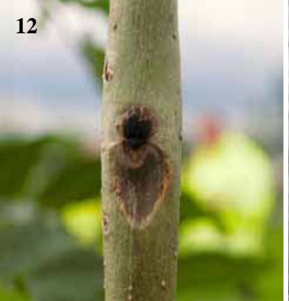
Older lesion associated with leaf scar.