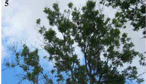
Mature trees affected by the disease initially display dieback of the shoots and twigs at the periphery of their crowns. Dense clumps of foliage may be seen further back on branches where recovery shoots are produced.