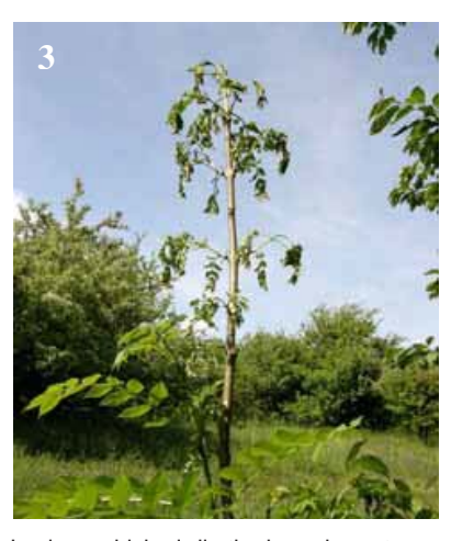
Lesions which girdle the branch or stem can cause wilting of the foliage above.