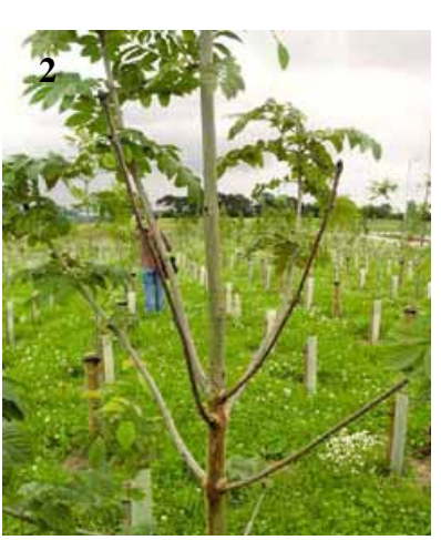
At the base of dead side shoots, lesions can often be found on the subtending branch or stem.