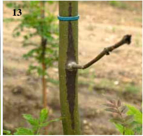
Developing lesion centred on a dead side shoot.