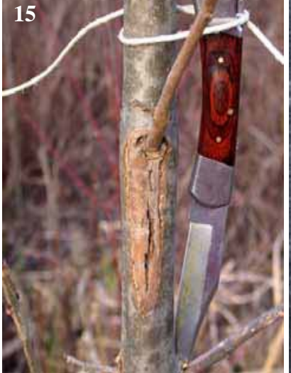
Old lesion centred on a dead side shoot.