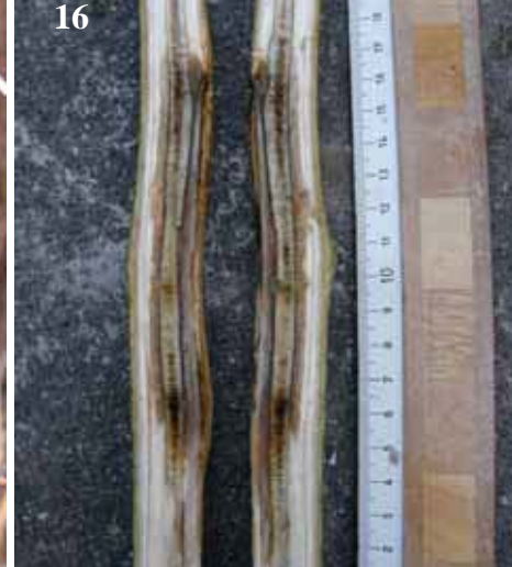
The wood and pith underlying bark lesions is usually strongly stained.