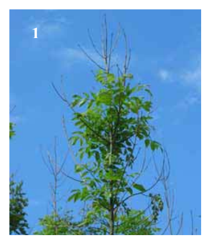
Diseased saplings typically display dead tops and/or side shoots.