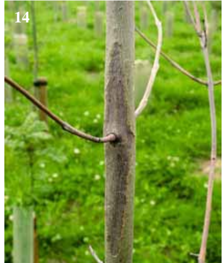
Older lesion centred on a dead side shoot.