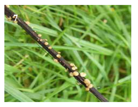
In late summer and early autumn ( July to October), fruiting bodies of the sexual stage of C. fraxinea can be found on blackened rachises (leaf stalks) of ash in damp areas of leaf litter beneath trees. These do not necessarily belong to the pathogen but can be tested to determine their identity.