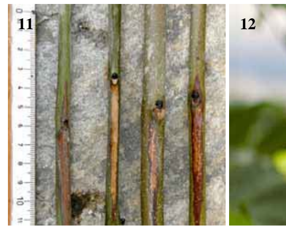
Developing lesions associated with leaf scars.