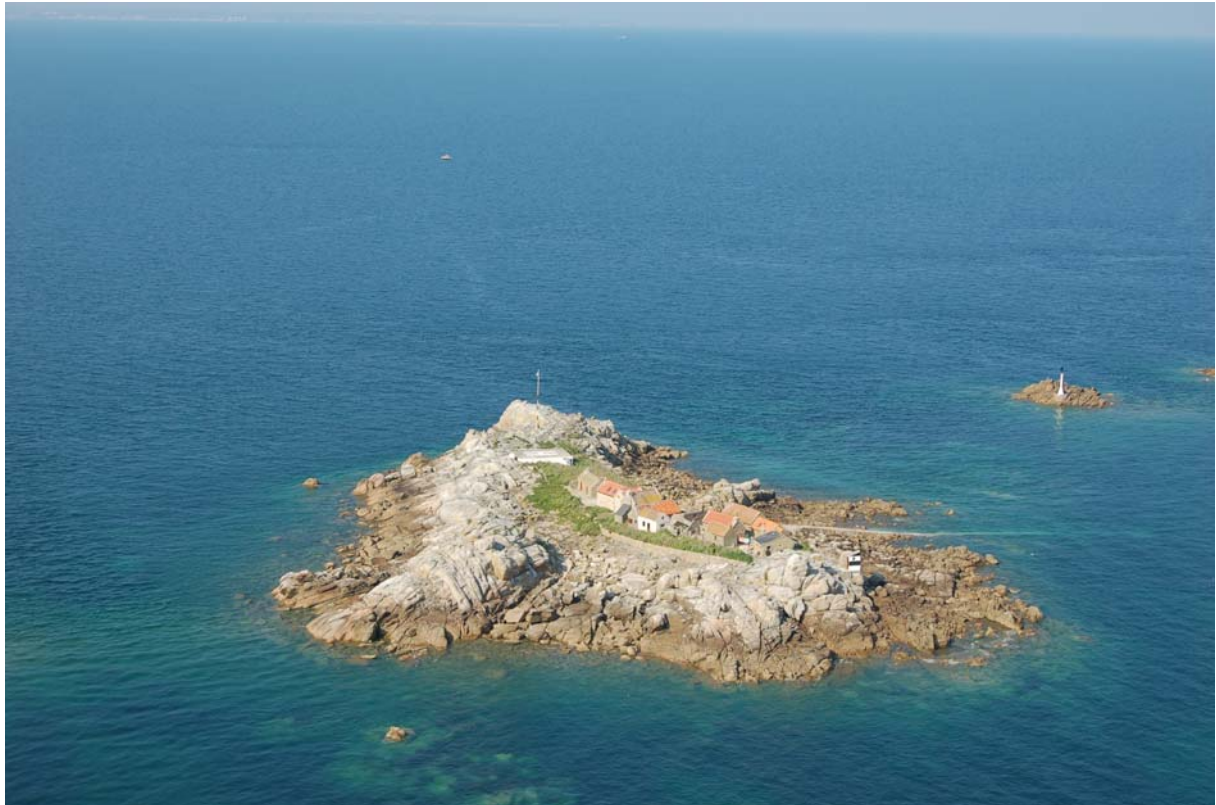
Maîtresse Île, Les Minquiers

There is also the tranquillity and scenic value to residents and visitors alike and it is of importance to those who simply value protecting a site and conserving natural resources for future generations. Whilst many of these values may be difficult to quantify there is an inherent value and therefore should be considered.